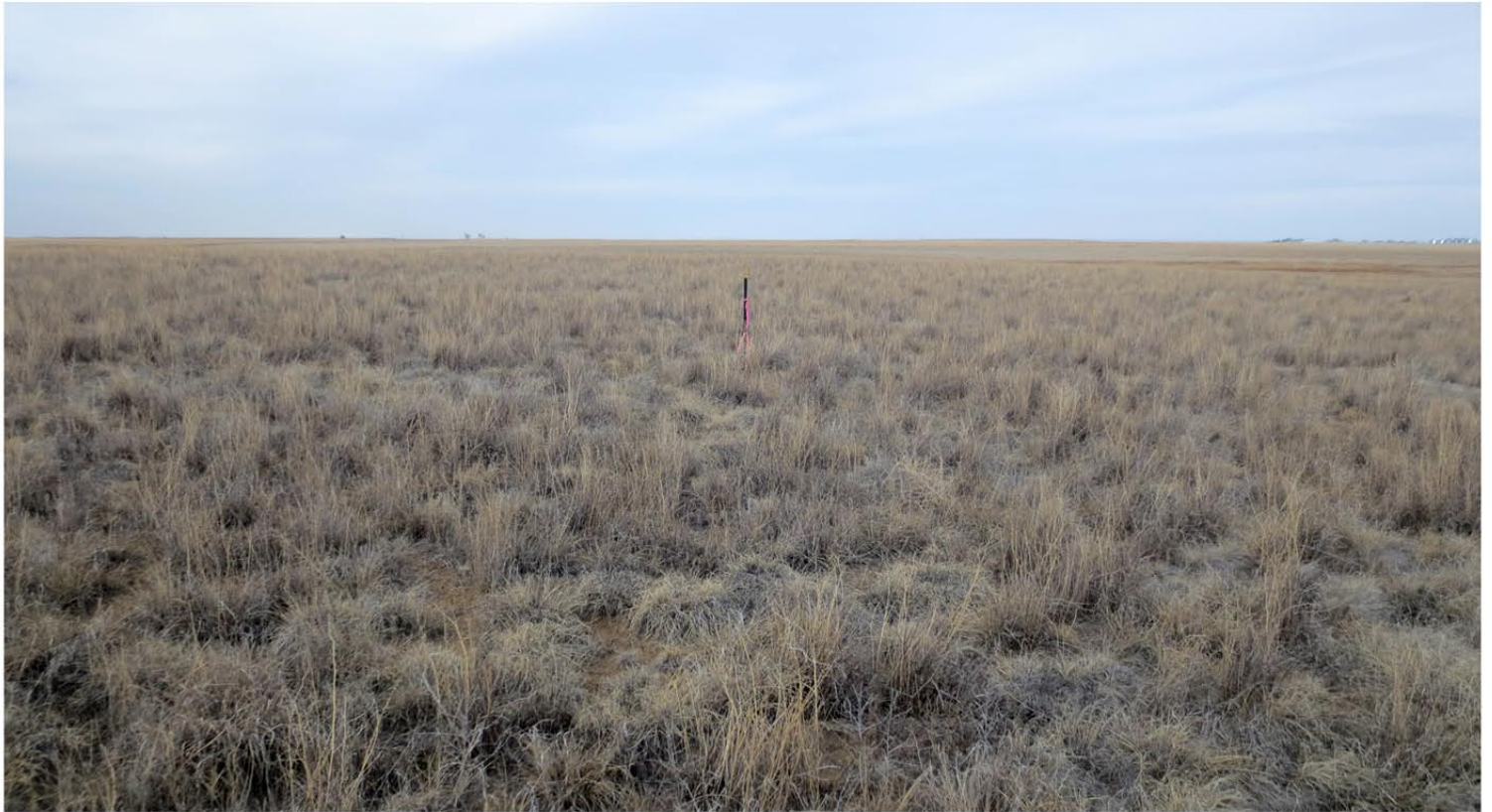
WELL PAD VIEW (LOOKING NORTH)