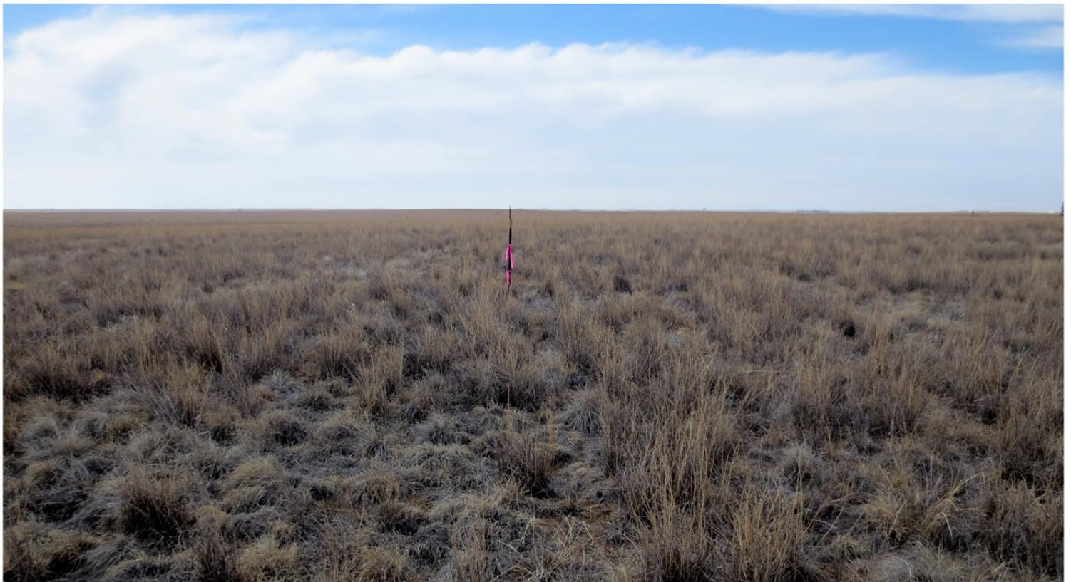
WELL PAD VIEW (LOOKING WEST)