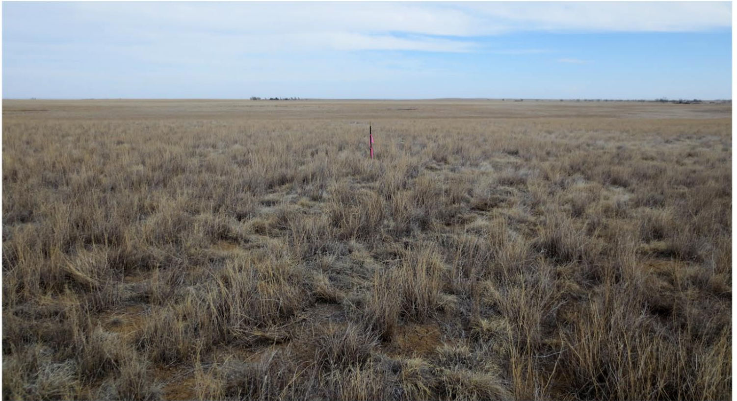
WELL PAD VIEW (LOOKING EAST)