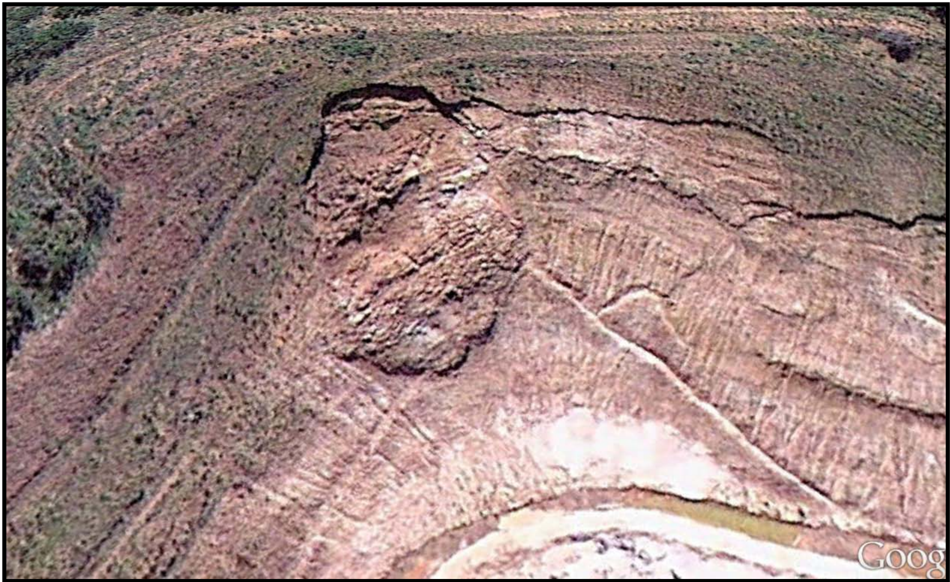
Google Earth 2011 aerial image. Close-up view of earth slumping feature.