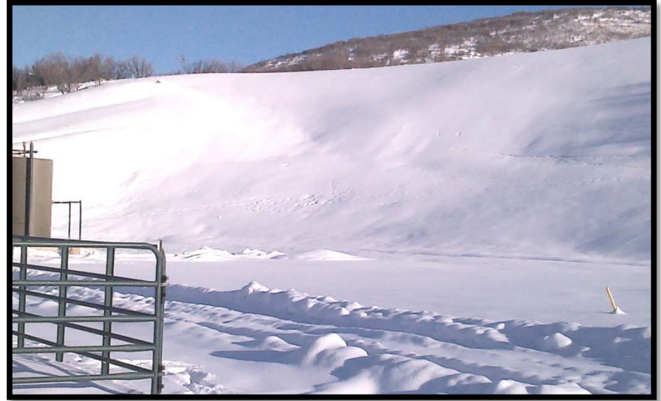
Close-up view of cutslope: Some features present, and may represent BMP mitigation, but difficult to assess due to heavy snow. Inspection of location will resume once snowmelt has subsided.