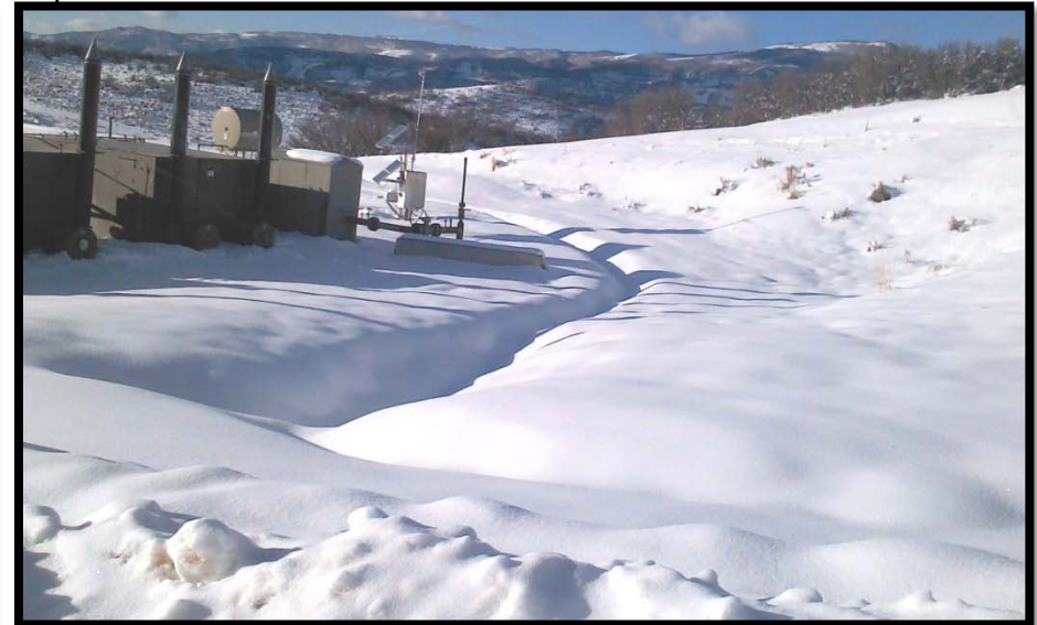
Viewing northwest: Diversions & drainage ditch BMPs.