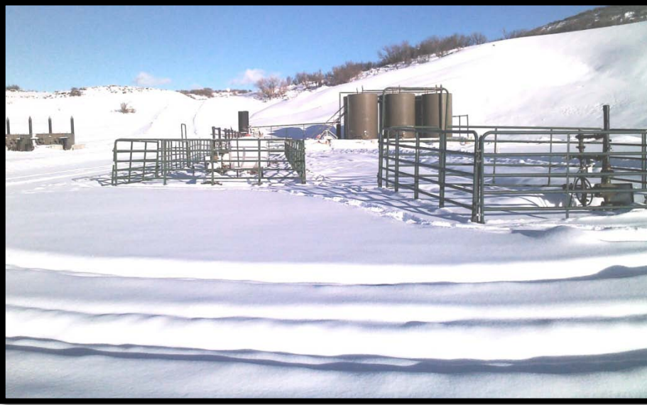
Viewing east; wellheads, equipment & tank layout & southeastern area of cut slope. Possible slumping along cut slope that was noted in a 2011 aerial image is presently indiscernible due to heavy snow.