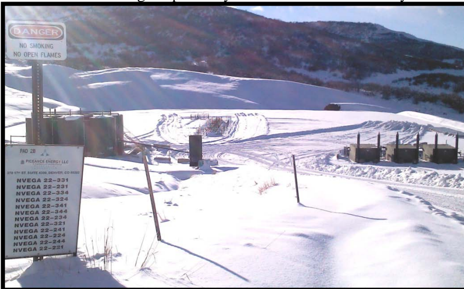
Viewing west @ entrance. Western cutslope & Stockpiled topsoil in background.