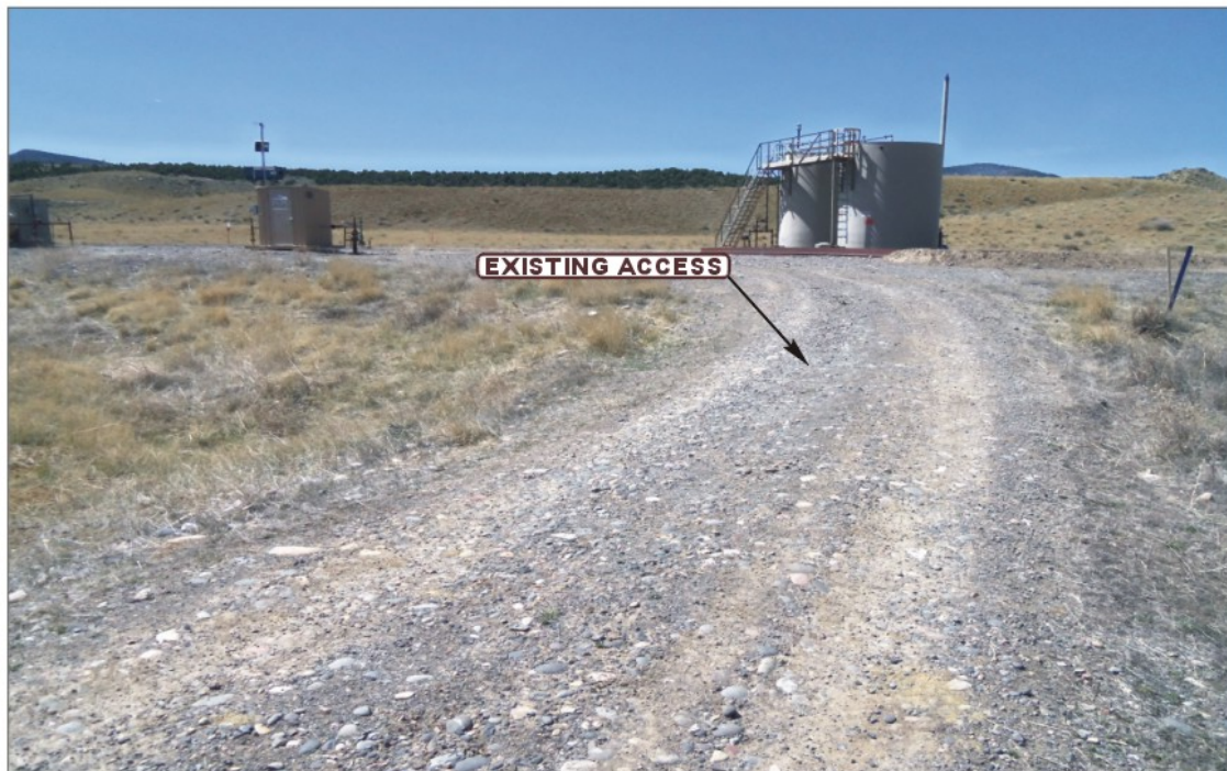
PHOTO: VIEW OF EXISTING ACCESS