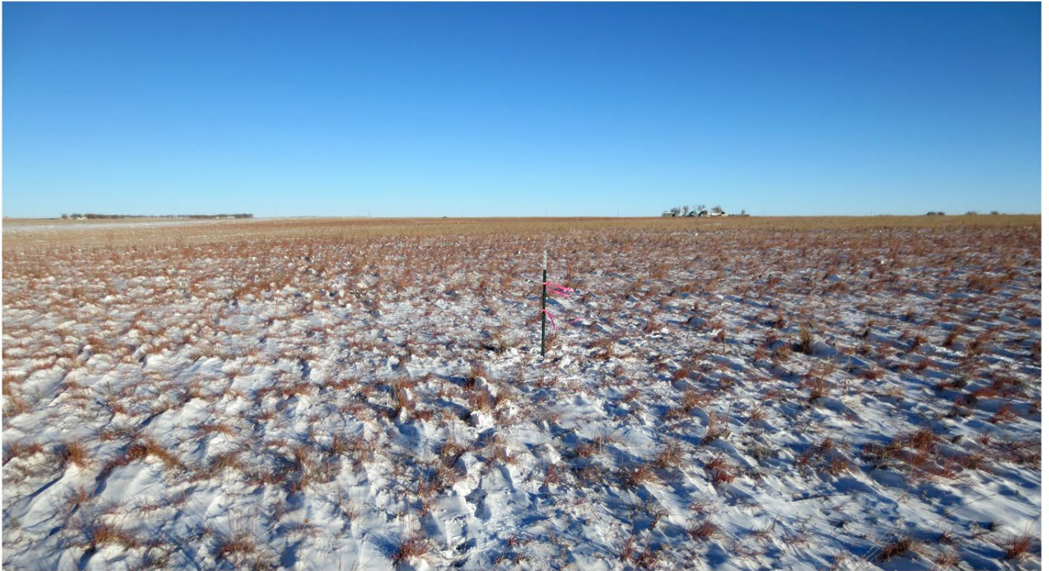
WELL PAD VIEW (LOOKING NORTH)