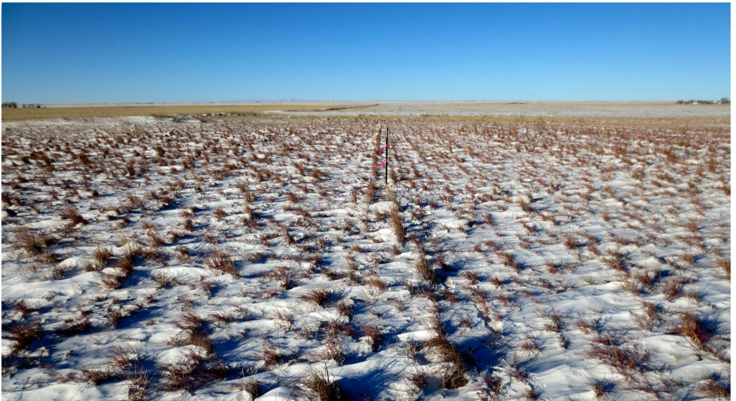
WELL PAD VIEW (LOOKING WEST)