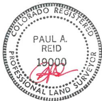
EXHIBIT I-B: VISIBLE IMPROVEMENTS PLAT HOMER DEEP UNIT 9-41AH LOCATED IN NE 1/4 NE 1/4 OF SECTION 9 T. 8 S., R. 98 W., 6TH P.M. GARFIELD COUNTY, COLORADO