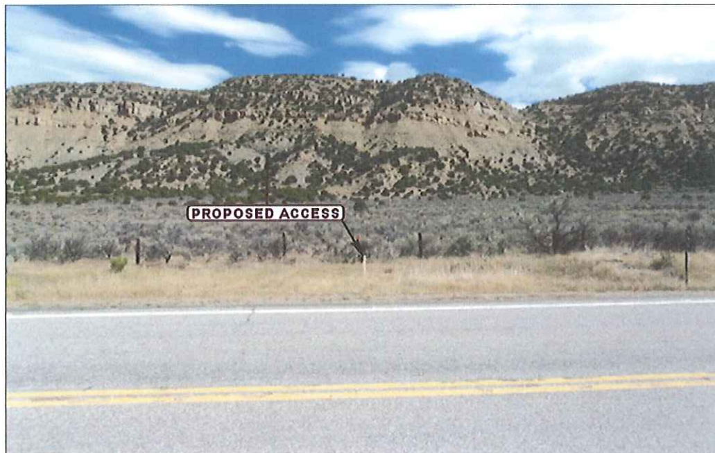
PHOTO: VIEW FROM BEGINNING OF PROPOSED ACCESS