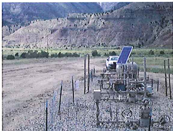
PAD LOCATION LOOKING WEST