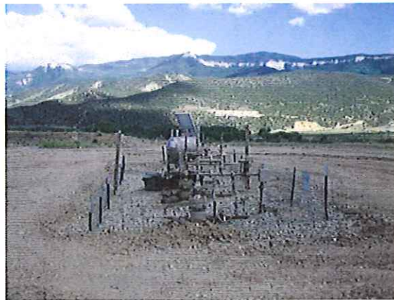
PAD LOCATION LOOKING EAST