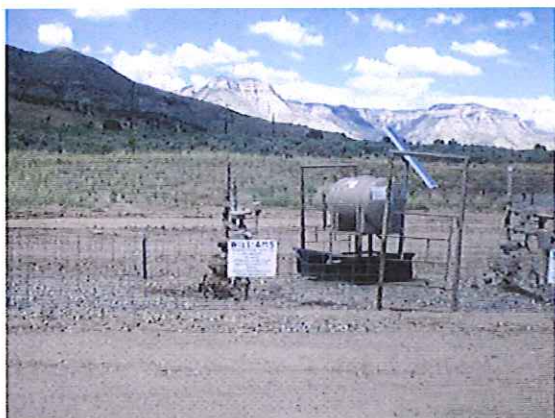
PAD LOCATION LOOKING NORTH