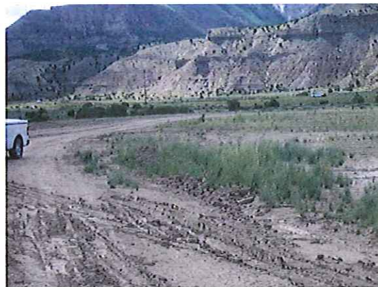
PAD ACCESS LOOKING NORTHWEST

136 East Third Street Rifle, Colorado 81650 Ph. (970) 625-2720 Fax (970) 625-2773