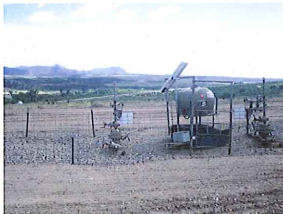
PAD LOCATION LOOKING SOUTH