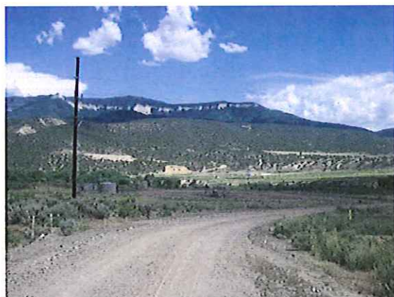
PAD OVERALL LOOKING SOUTHEAST