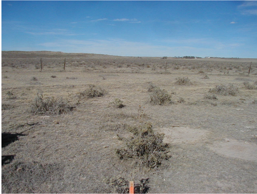
Refernce Area Razor Section 25 Looking North

Whiting Oil and Gas Corporation Razor Section 24&25 T10N R58W Reference Area 40.816825190 -103.811966121 NAD83