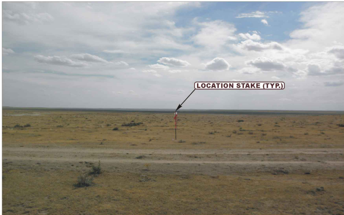
PHOTO: VIEW OF LOCATION STAKES