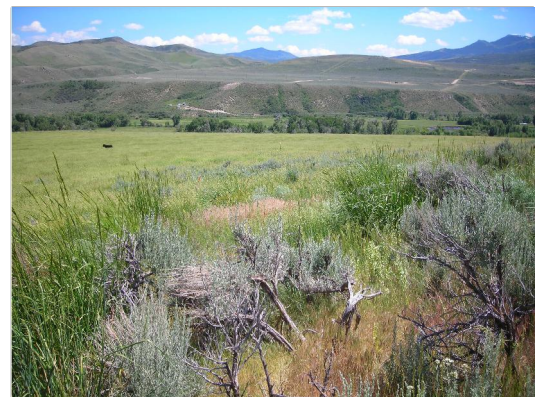
VANTAGE POINT #2