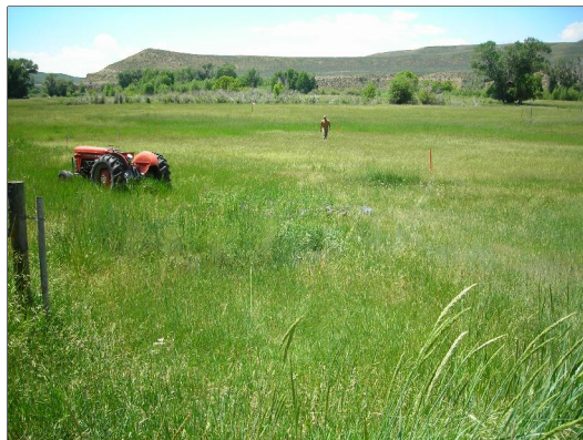
VANTAGE POINT #1