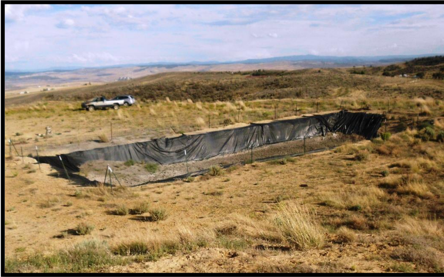
Viewing Southeast: well location with un-reclaimed drill cuttings pit & TA wellhead, (left in photo)