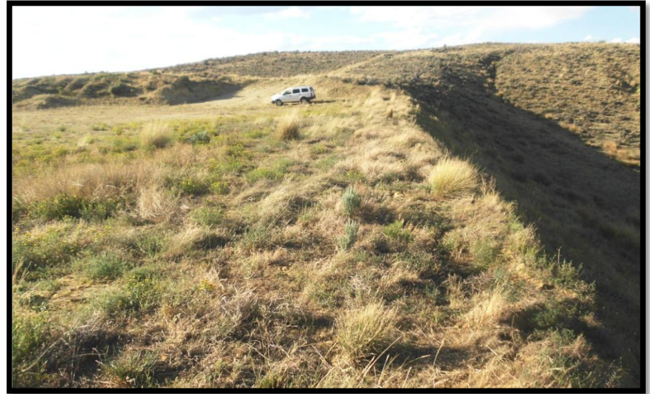
Viewing northerly, eastern portion of location