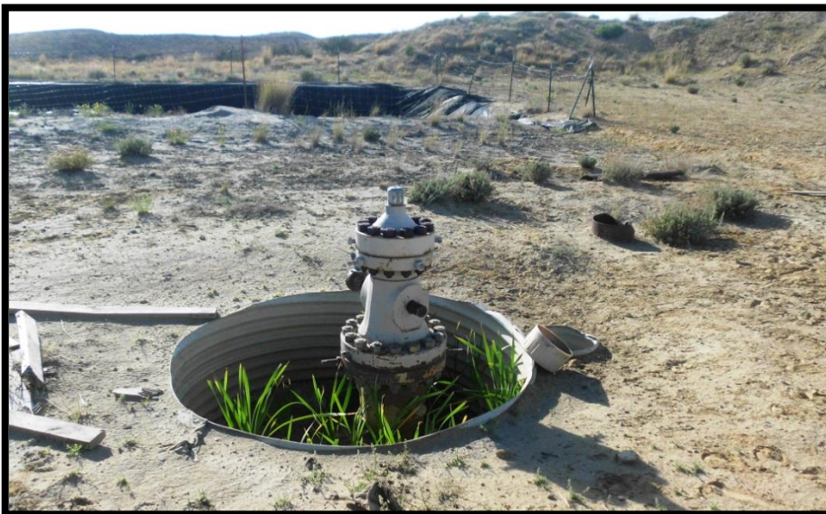
Temporarily abandoned wellhead, cellar & rathole.