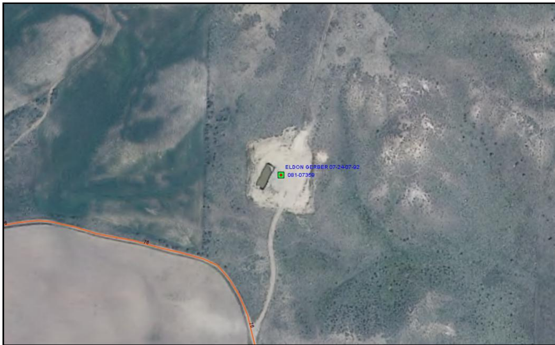
COGS GIS Online 2009 Aerial photo. Well pad, drill pit and access road.