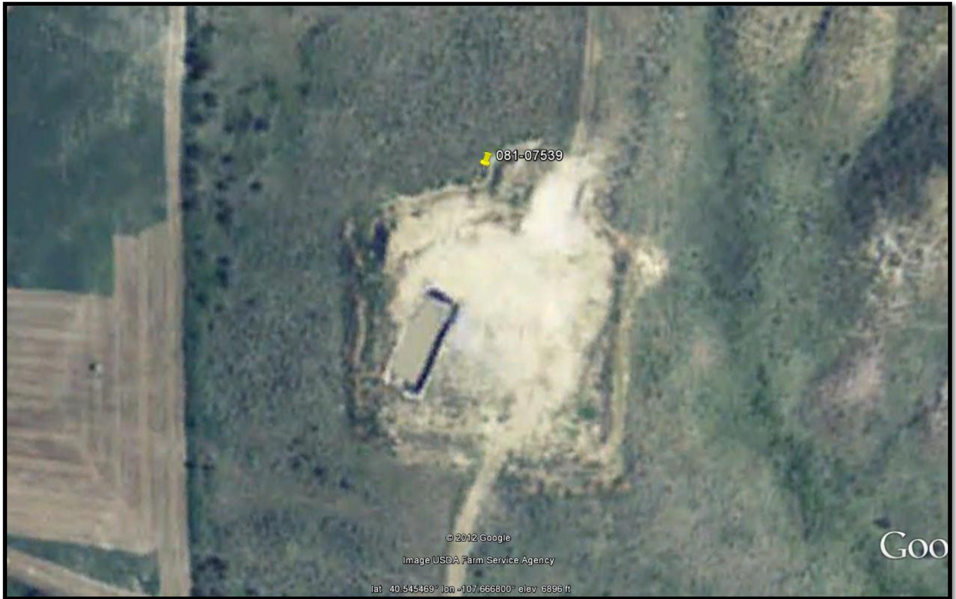
Google Maps Aerial Photo Date August 2011: well pad location & drill pit.