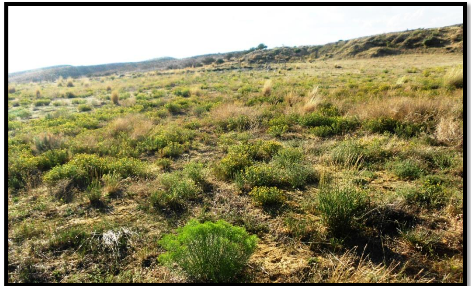
Viewing west: well pad location, general vegetation type & density, & excavated spoils pile bermed to the north & northwest