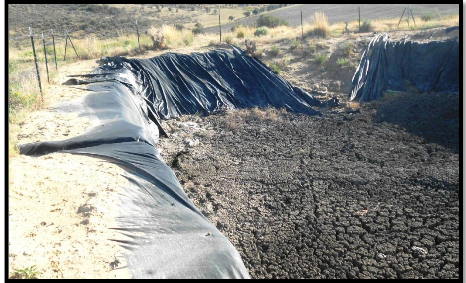
Viewing South: contents of pit & liner condition, which is dilapidated and sagging. Fencing in disrepair.