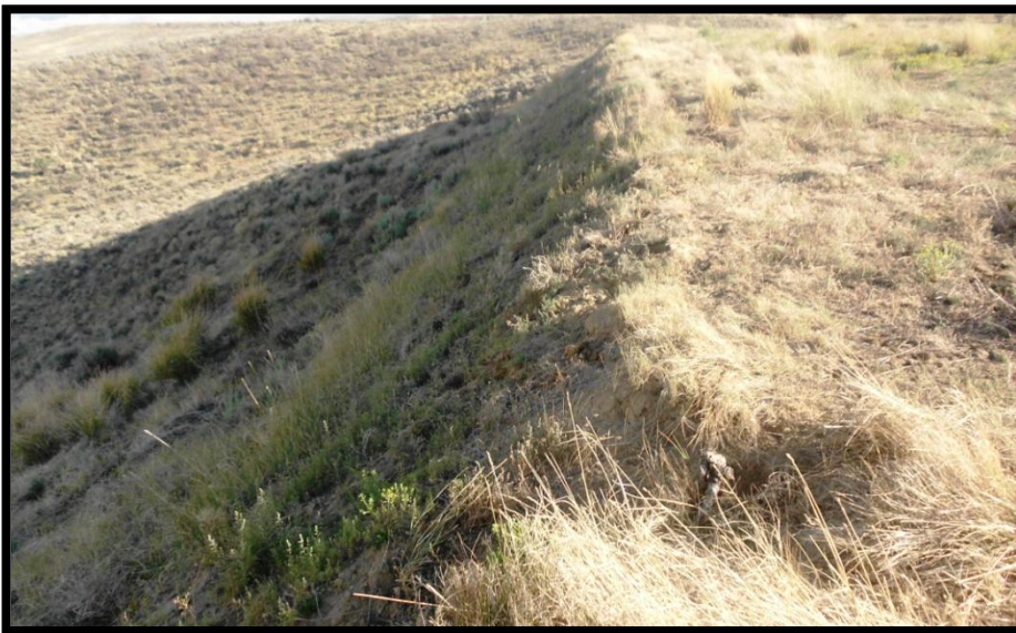
Viewing south along the eastern perimeter berm: localized erosion channels: even though they are well vegetated & appear stable.