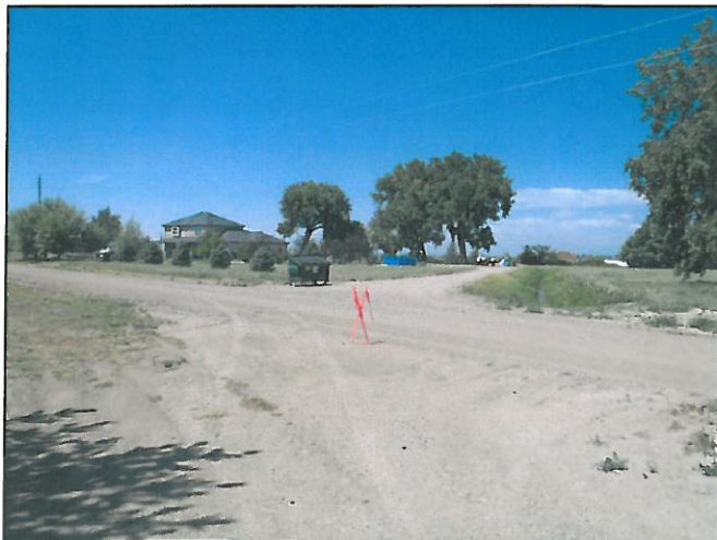
Looking from the access to the roadway