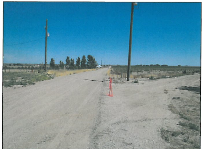
Looking down the roadway to the right of the access