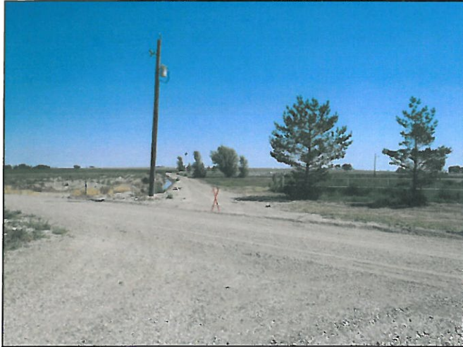
Looking from the roadway into the access location