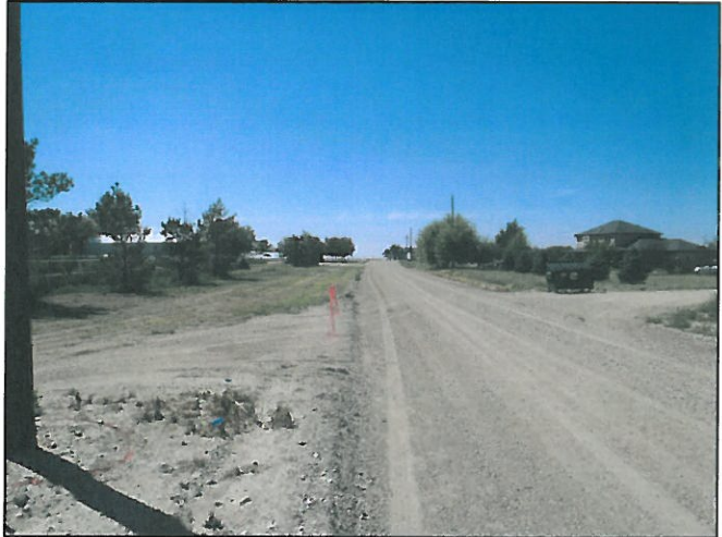
Looking down the roadway to the left of the access