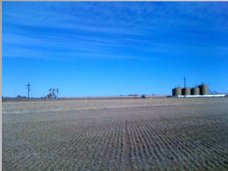
Gurtler facility • North View