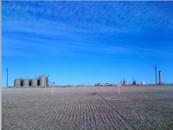
Gurtler wells • North View