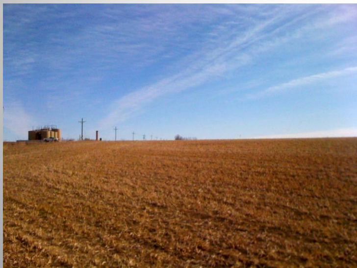
Gurtler facility • East View