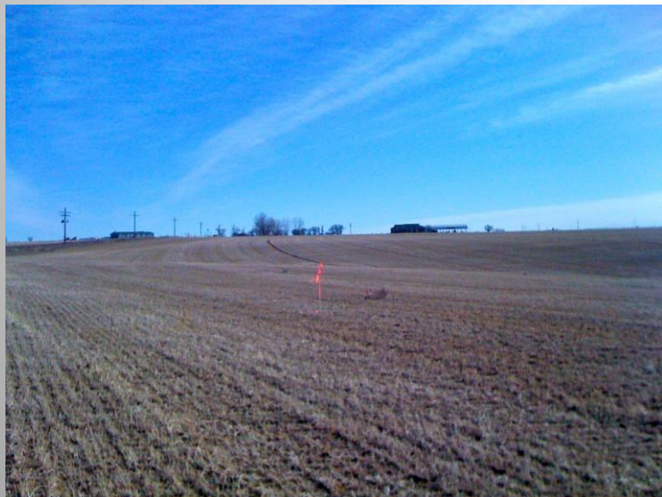
Gurtler wells • East View