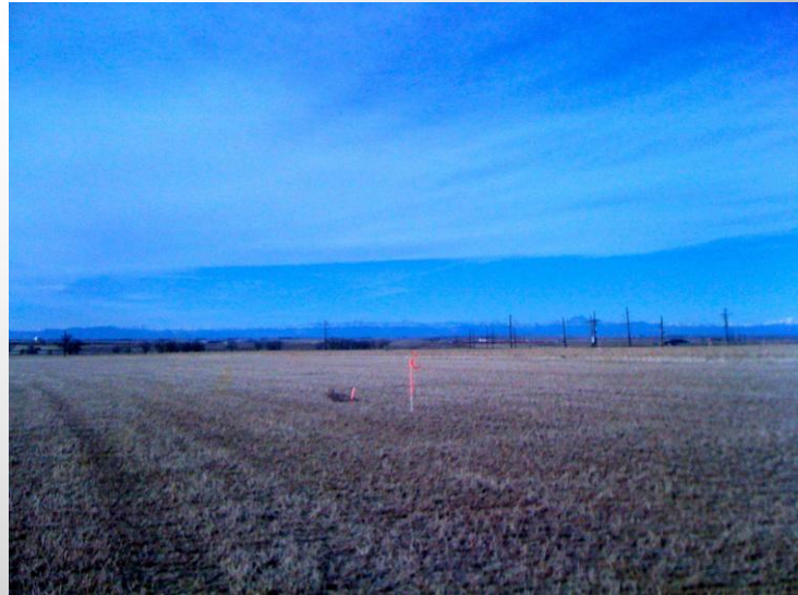
Gurtler wells • West View

Date of Photography: February 22, 2012 Surface use is a cultivated field