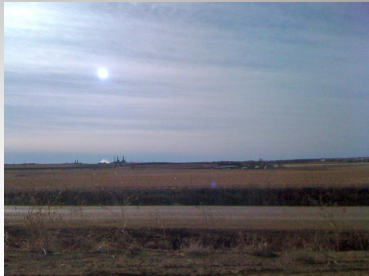
Gurtler facility • South View