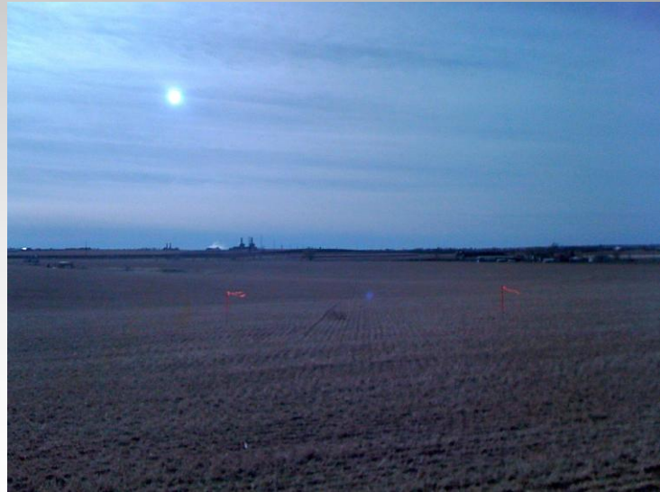
Gurtler wells • South View