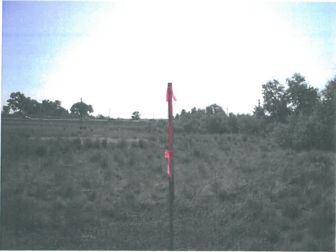
Figure 2: OLSON 41-3 LOOKING EAST (NE1/4 NE1/4 SEC 3, T3N, R68W, 6-26-12)