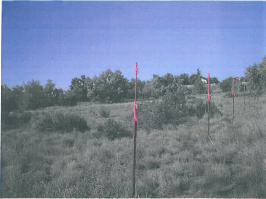
Figure 3: OLSON 41-3 LOOKING SOUTH (NE1/4 NE1/4 SEC 3, T3N, R68W, 6-26-12)