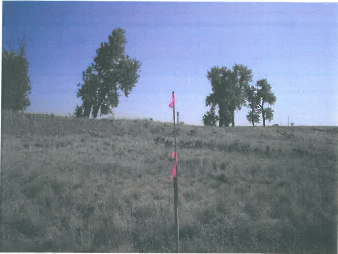
Figure 1: OLSON 41-3 LOOKING NORTH TOWARD TANK BATTERY AND ACCESS ROAD (NE1/4 NE1/4 SEC 3, T3N, R68W, 6-26-12)