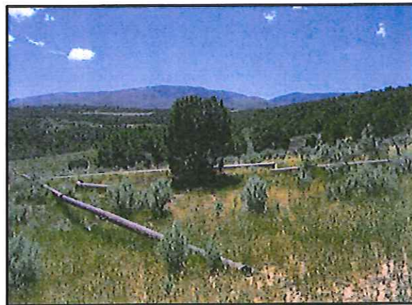
PAD LOCATION LOOKING SOUTH