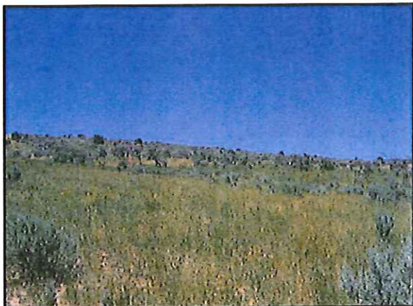
PAD LOCATION LOOKING WEST