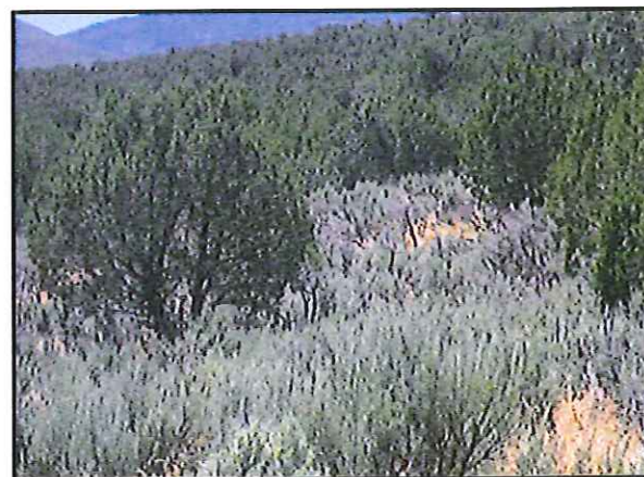
PAD ACCESS (SOUTH)