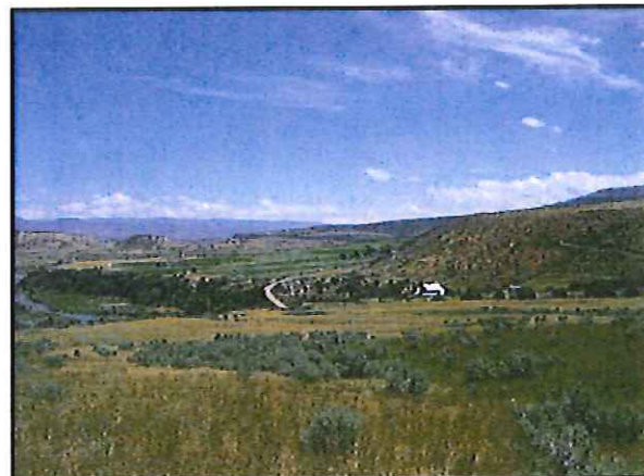
PAD LOCATION LOOKING EAST