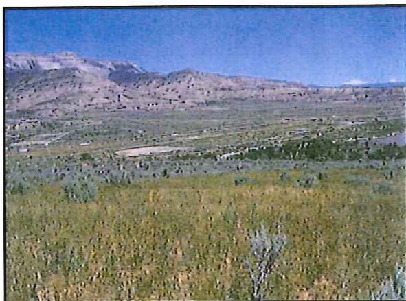
PAD OVERALL (NORTHEAST)