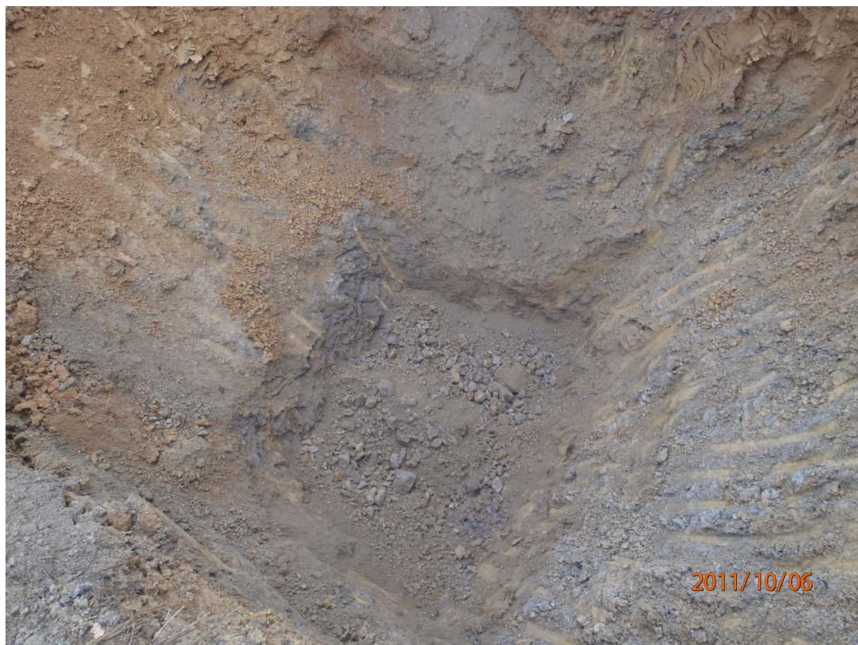
Visual representation of the remediated pit; depth presented is at 11 feet