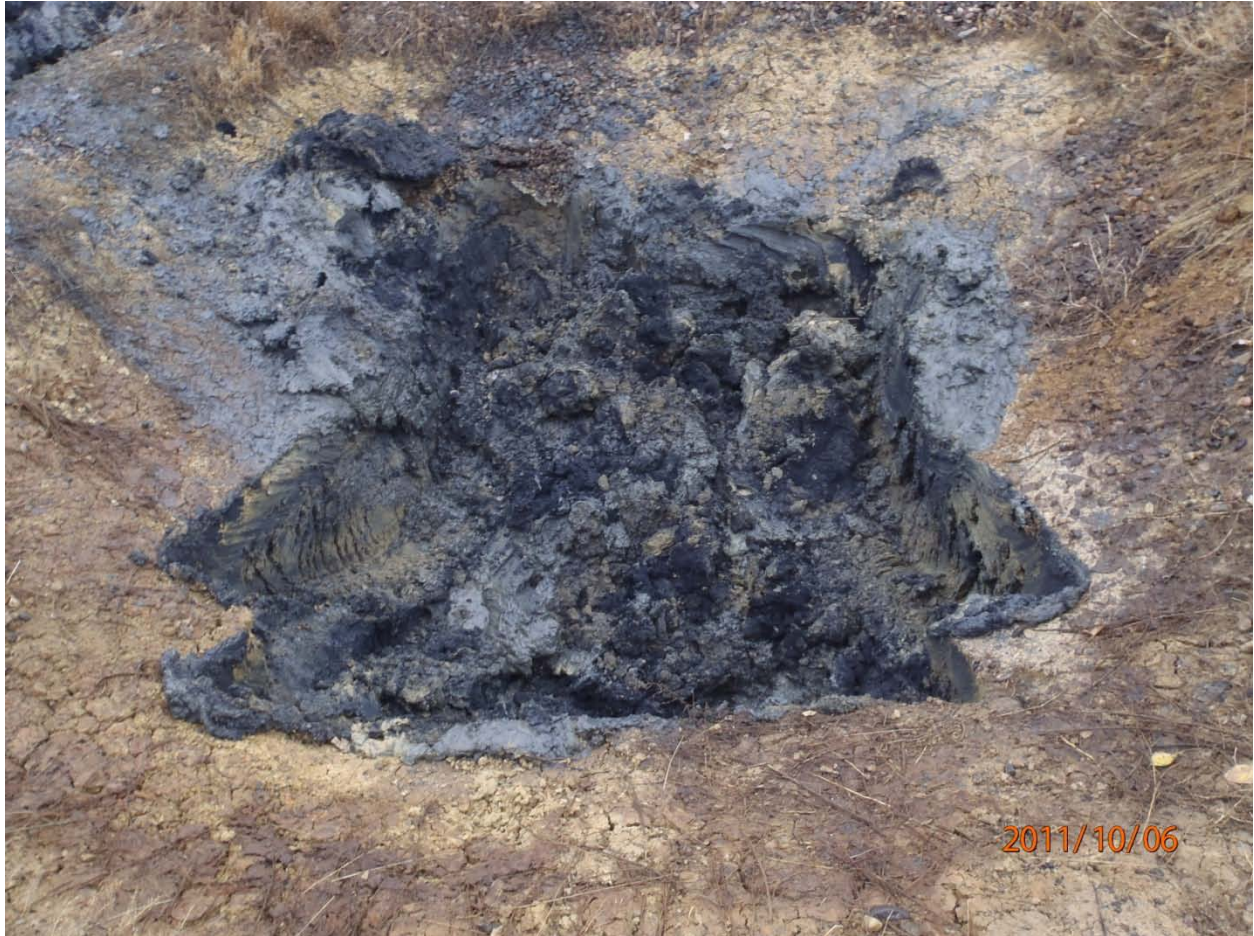
Visual representation of pit during excavation; depth presented is at 2 feet