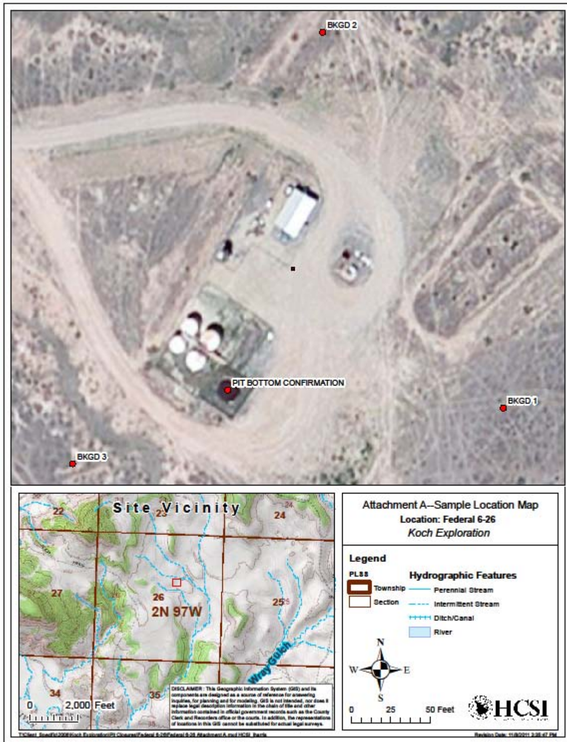
Figure 1 GIS Map of Sampling Locations

COGCC Operator # 49100 County: Rio Blanco