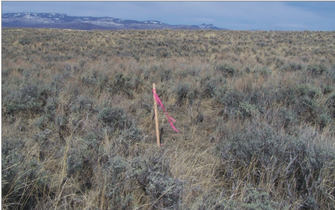
PHOTO: VIEW OF REFERENCE AREA