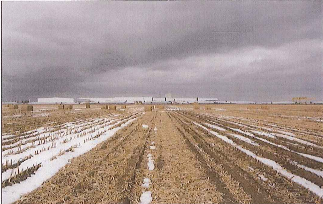
PHOTO: VIEW OF REFERENCE AREA

GREAT WESTERN #25-12-15, #25-24-24, #25-53, #25-24, #25-24-23, #25-22-18, #25-23, #25-22-13 & #25-22-14 LOCATED IN WELD COUNTY, COLORADO SECTION 25, T6N, R67W, 6th P.M.