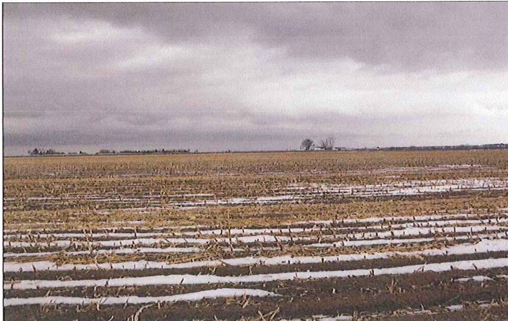
PHOTO: VIEW OF REFERENCE AREA