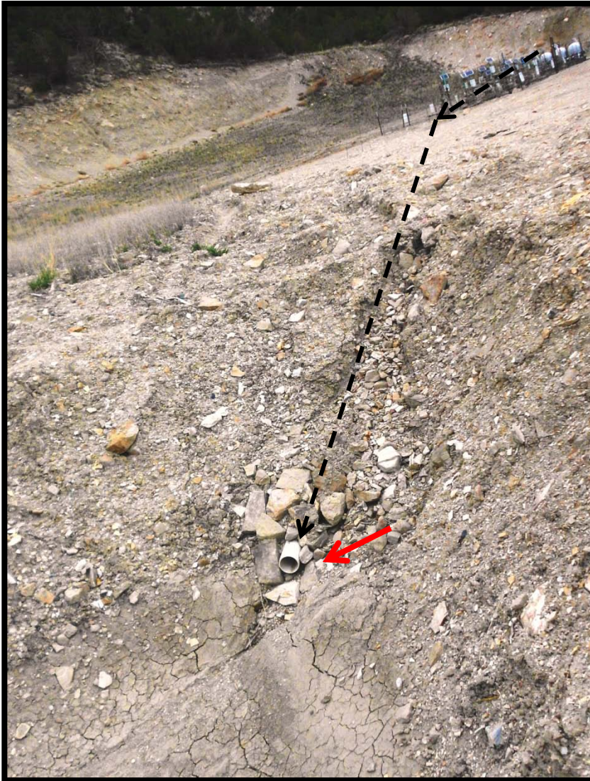
Viewing northerly: discharge outlet and rilling