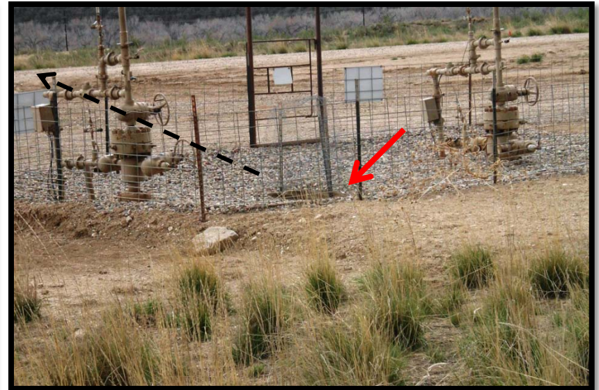
Viewing south: Stormwater collection drain & approximate orientation of subsurface piping.