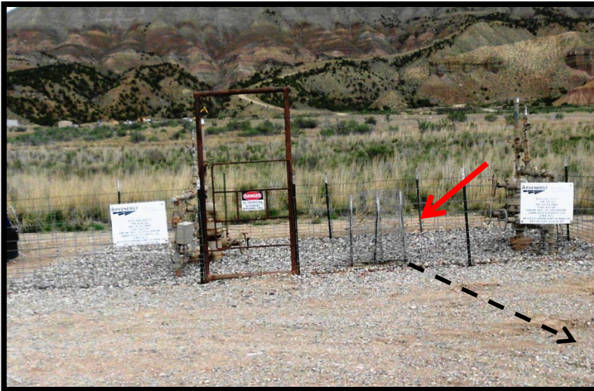
Viewing north: Stormwater collection drain & approximate orientation of subsurface piping.