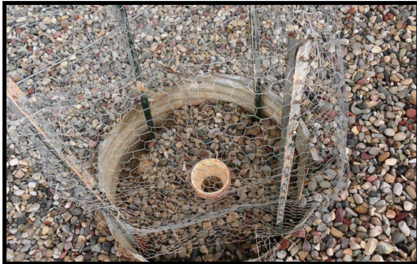
Close up view