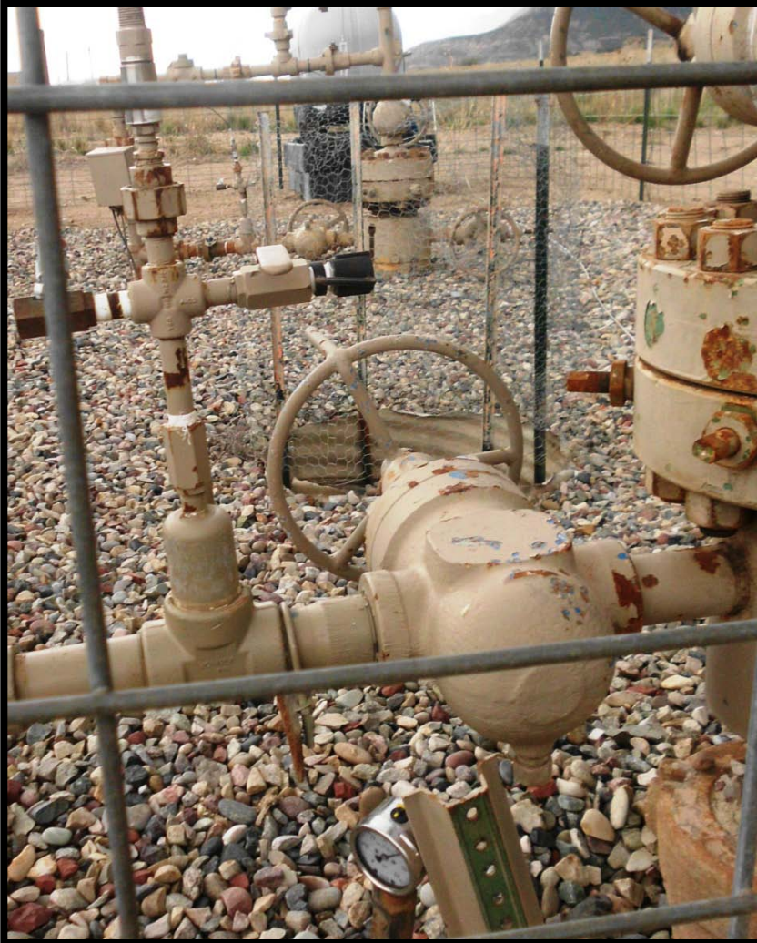
Western view: Stormwater collection drain (inside corrugated culvert between wellheads).