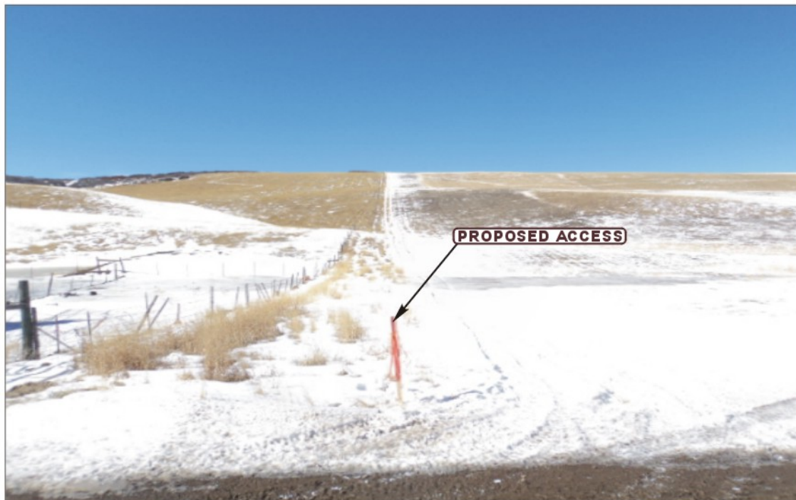
PHOTO: VIEW FROM BEGINNING OF PROPOSED ACCESS