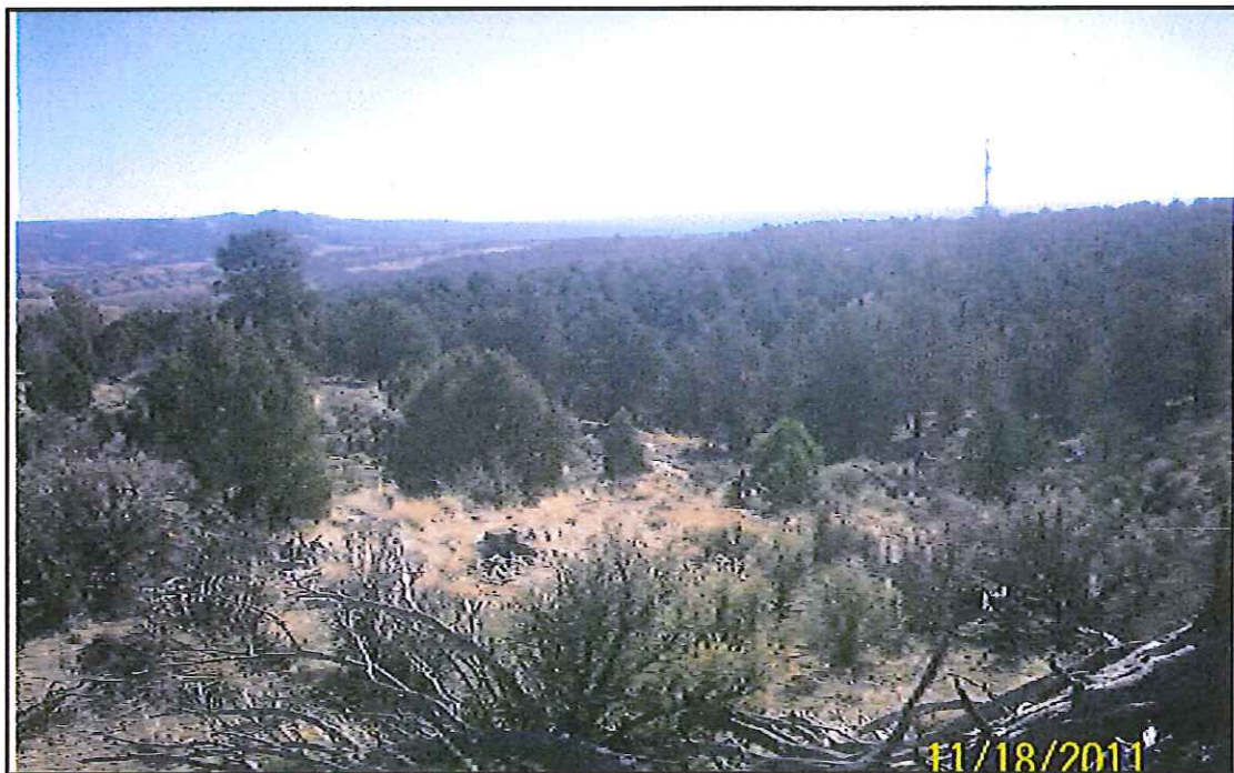
PHOTO: VIEW FROM PAD CENTER