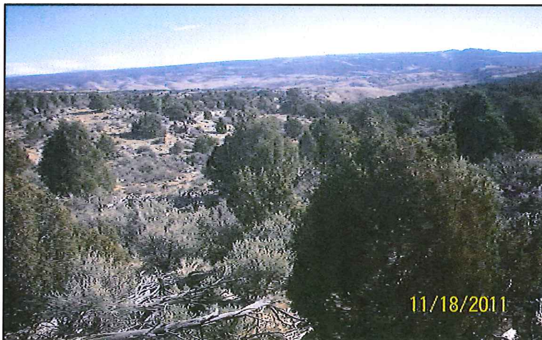
PHOTO: VIEW OF OVERALL DRILL PAD