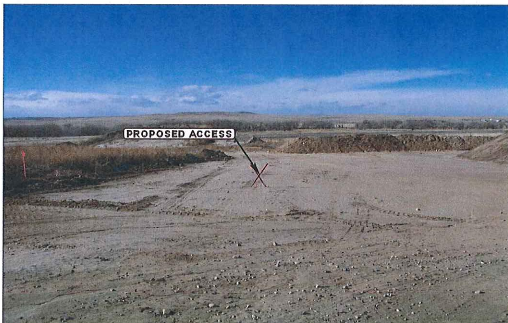
PHOTO: VIEW OF PROPOSED ACCESS