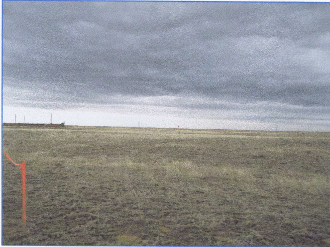
CROW VALLEY 6-61-16-4HSouth.jpg