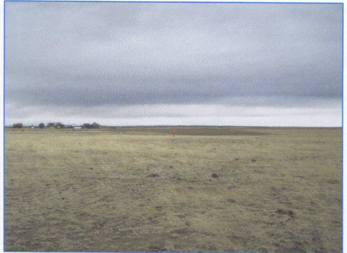
CROW VALLEY 6-61-16-4HWest.jpg