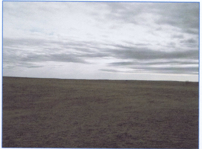
CROW VALLEY 6-61-16-4HEast.jpg