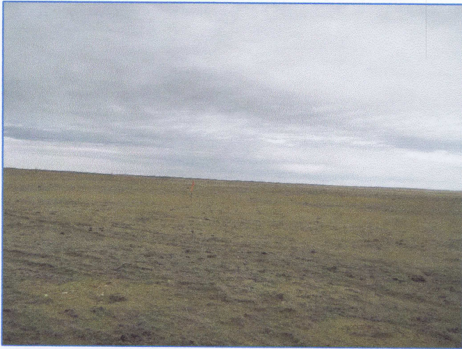
CROW VALLEY 6-61-16-4HNorth.jpg