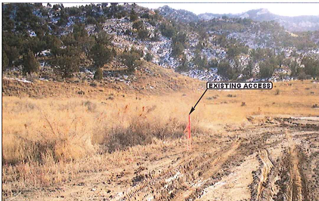
PHOTO: VIEW OF EXISTING ACCESS