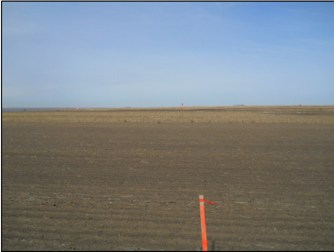
CROW VALLEY 7-62-22-2H North.jpg