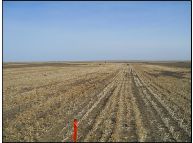
CROW VALLEY 7-62-22-2H East.jpg