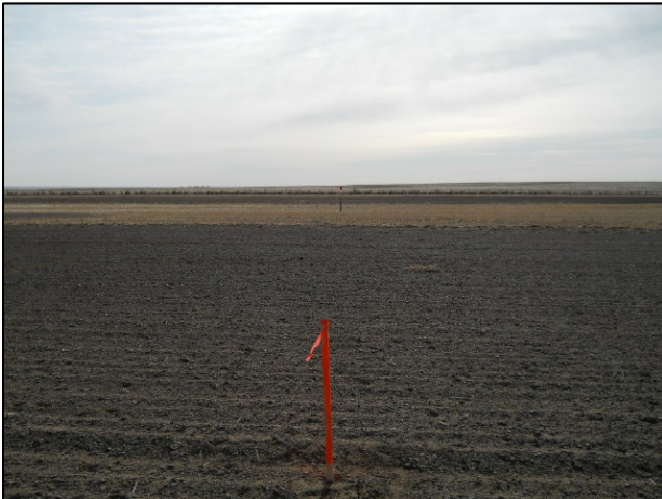
CROW VALLEY 7-62-22-2H South.jpg