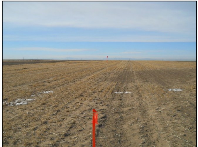
CROW VALLEY 7-62-22-2H West.jpg