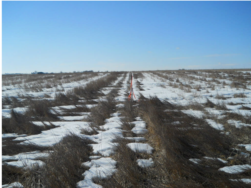
Schlachter 843-31-31 NW ¼ NE ¼ SEC. 31, T8N, R43W Looking West 15 February, 2012