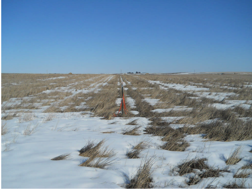
Schlachter 843-31-31 NW ¼ NE ¼ SEC. 31, T8N, R43W Looking East 15 February, 2012