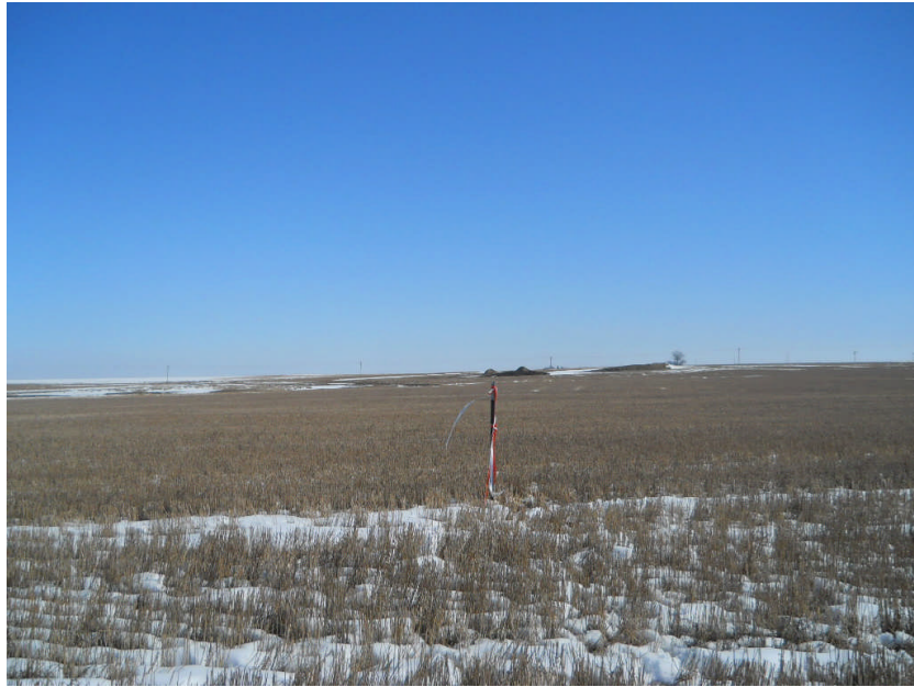
On The Brink 843-3-34 SW ¼ SE ¼ SEC. 3, T8N, R43W Looking East 14 February, 2012