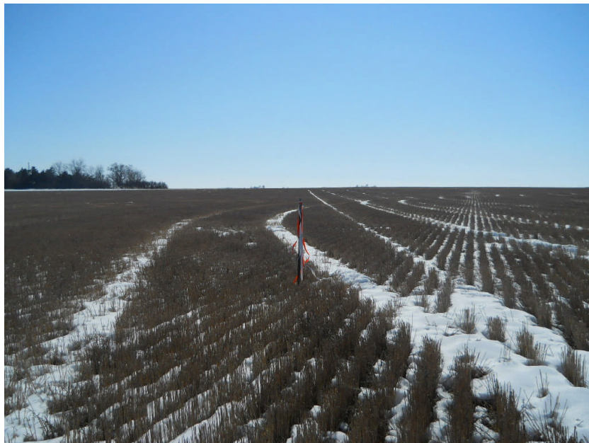
On The Brink 843-3-34 SW ¼ SE ¼ SEC. 3, T8N, R43W Looking South 14 February, 2012