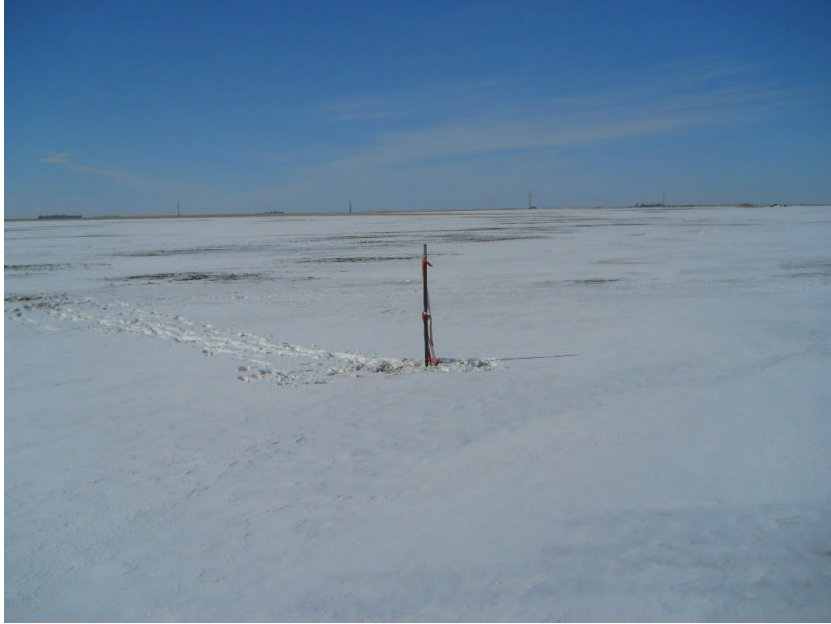
On The Brink 843-3-33 NW ¼ SE ¼ SEC. 3, T8N, R43W Looking West 14 February, 2012