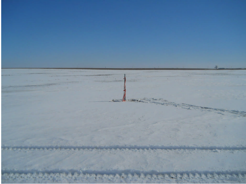
On The Brink 843-3-33 NW ¼ SE ¼ SEC. 3, T8N, R43W Looking East 14 February, 2012