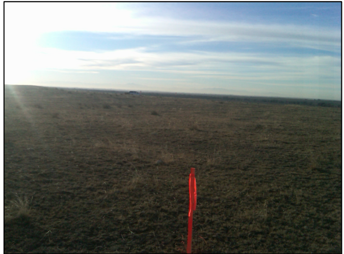
CROW VALLEY 7-62-30-2H West.jpg