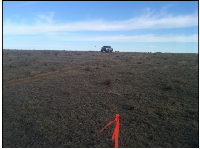
CROW VALLEY 7-62-30-2H East.jpg