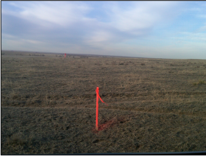
CROW VALLEY 7-62-30-2H North.jpg