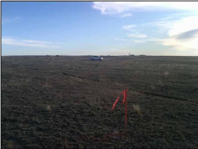
CROW VALLEY 7-62-30-2H South.jpg