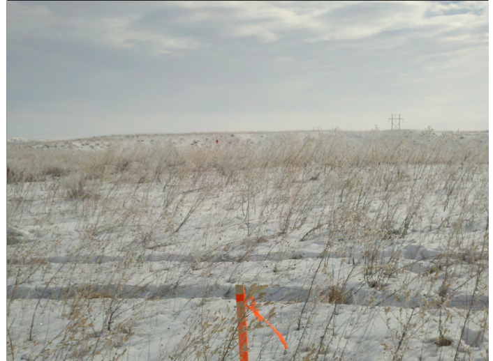
FRENCH LAKE 3-63-14-3H East.jpg