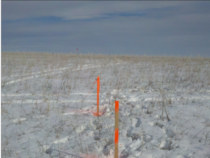
FRENCH LAKE 3-63-14-3H North.jpg