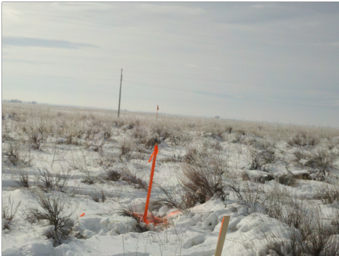
FRENCH LAKE 3-63-14-3H South.jpg