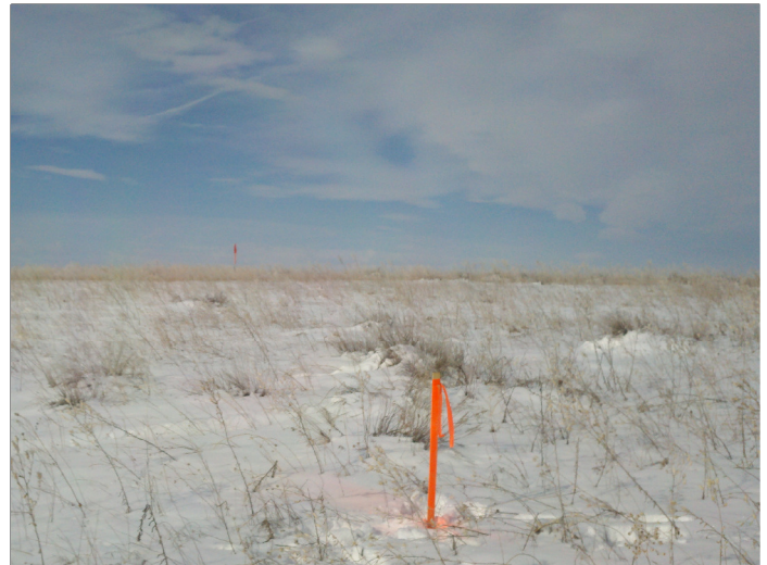
FRENCH LAKE 3-63-14-3H West.jpg