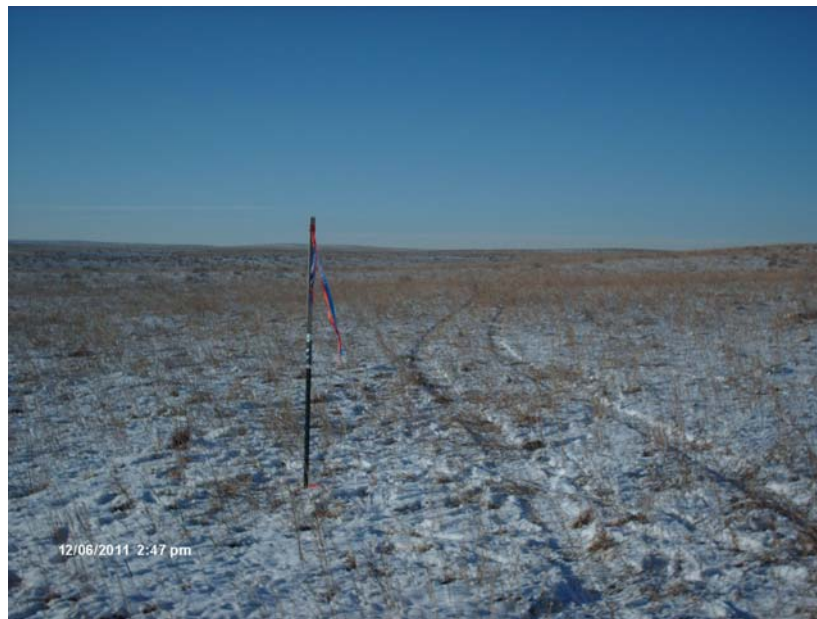
STATE ANTELOPE 14-11-24HZ SE 1/4 SW 1/4 SEC. 24 T5N R62W LOOKING NORTHWEST DECEMBER 6, 2011