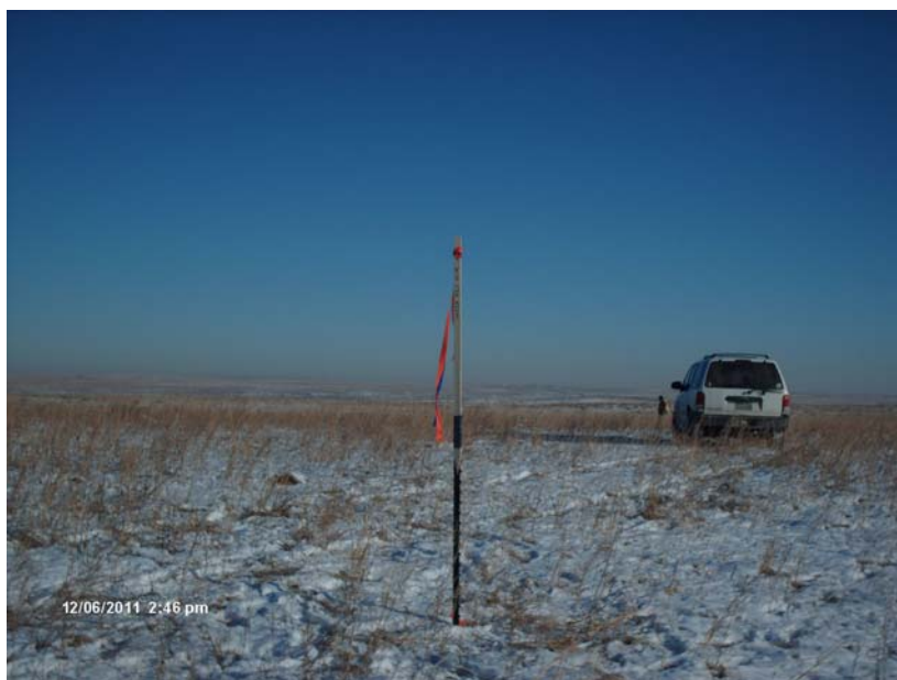
STATE ANTELOPE 14-11-24HZ SE 1/4 SW 1/4 SEC. 24 T5N R62W LOOKING SOUTHEAST DECEMBER 6, 2011