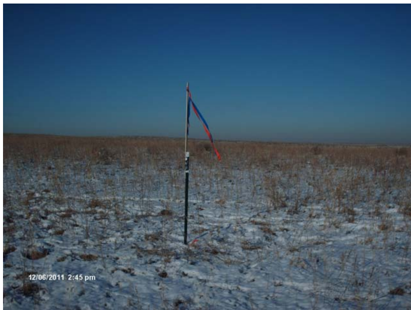
STATE ANTELOPE 14-11-24HZ SE 1/4 SW 1/4 SEC. 24 T5N R62W LOOKING NORTHEAST DECEMBER 6, 2011