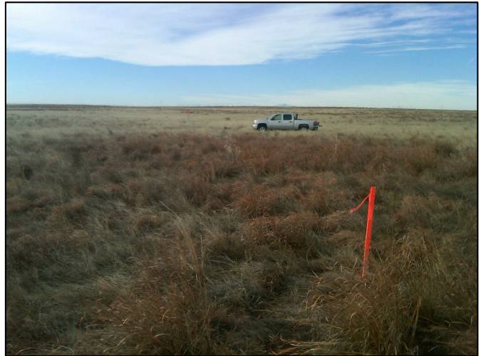
CROW VALLEY 7-62-34-2H West.jpg