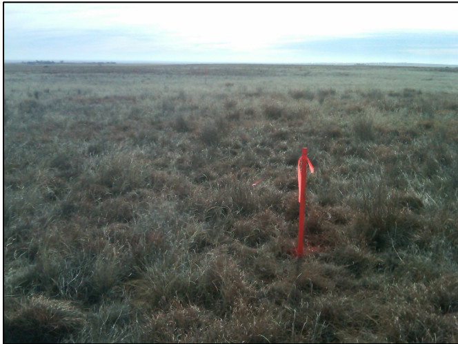
CROW VALLEY 7-62-34-2H South.jpg