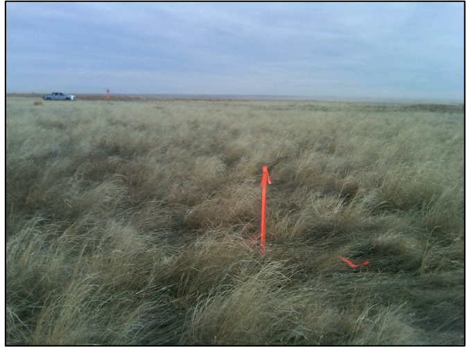
CROW VALLEY 7-62-34-2H East.jpg