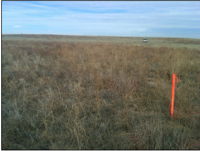
CROW VALLEY 7-62-34-2H North.jpg