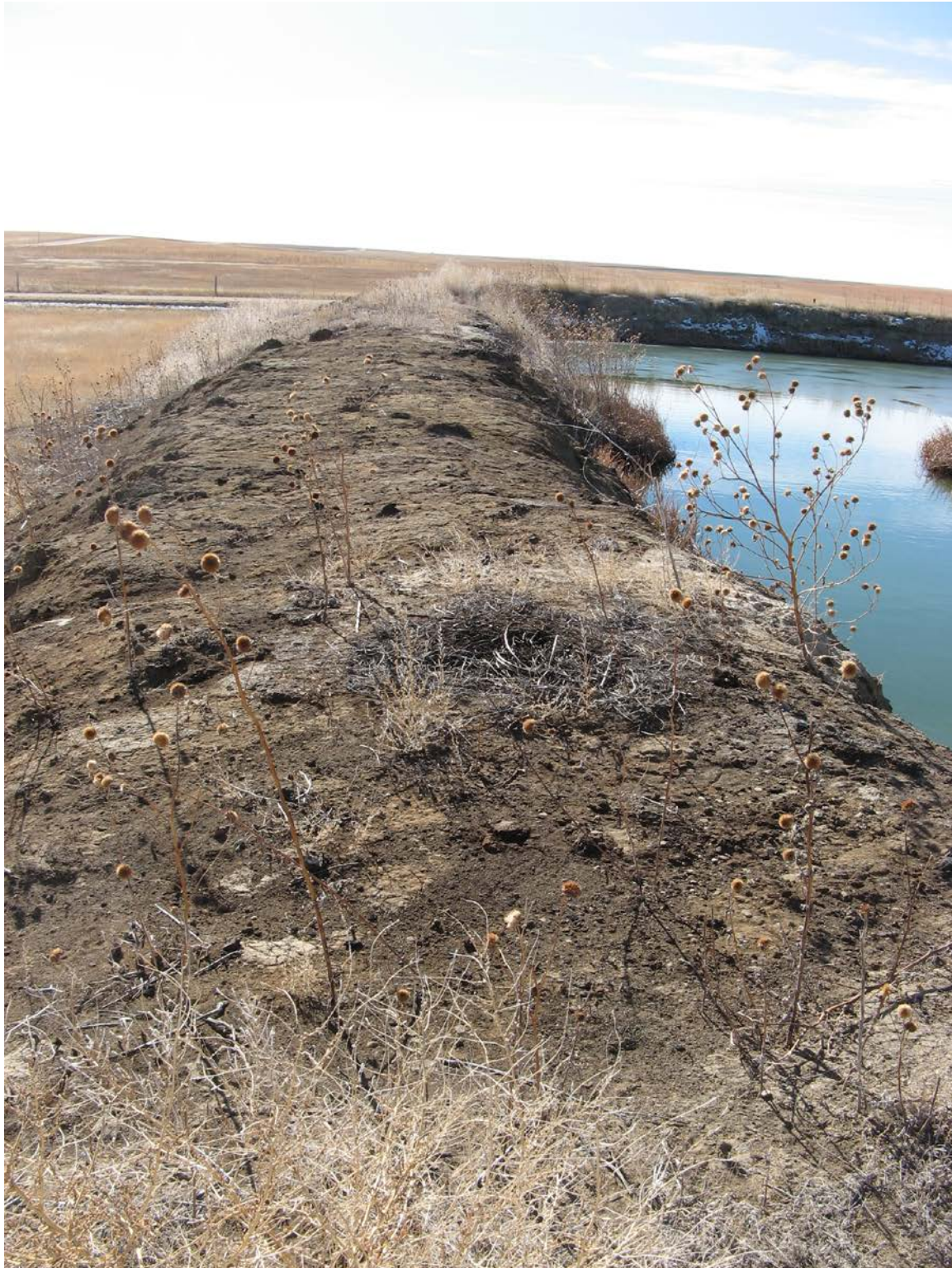
Looking south - oily waste in east berm of water pit.