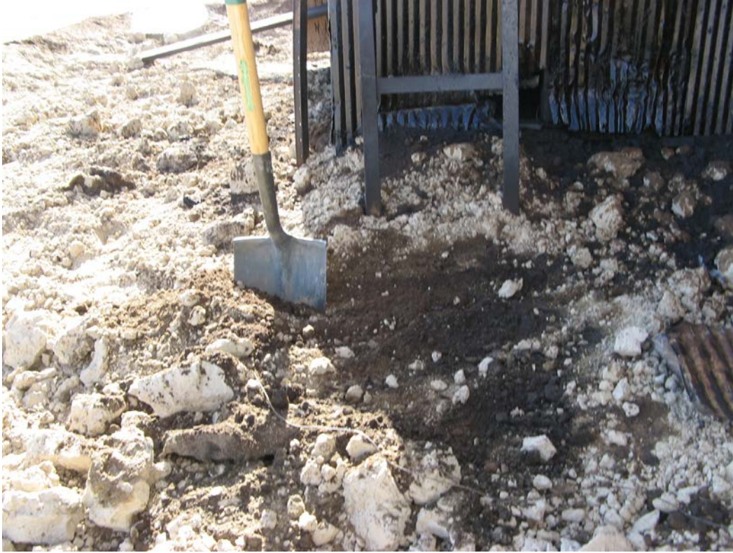
Fresh dirt scraped away adjacent treater shed underlain by oil saturated material.