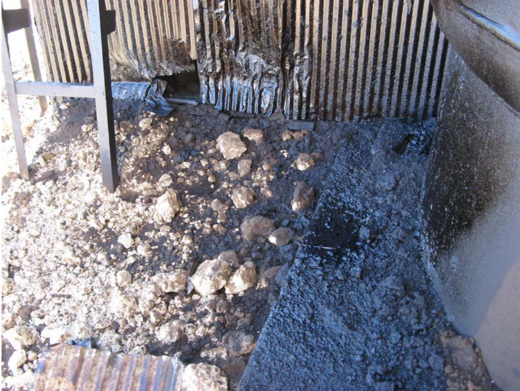
Free phase hydrocarbons at base of treater and fresh dirt covering oil saturated material.