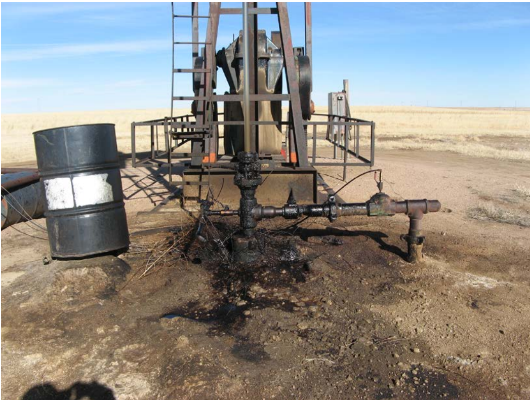
Ongoing leak at pumping unit.