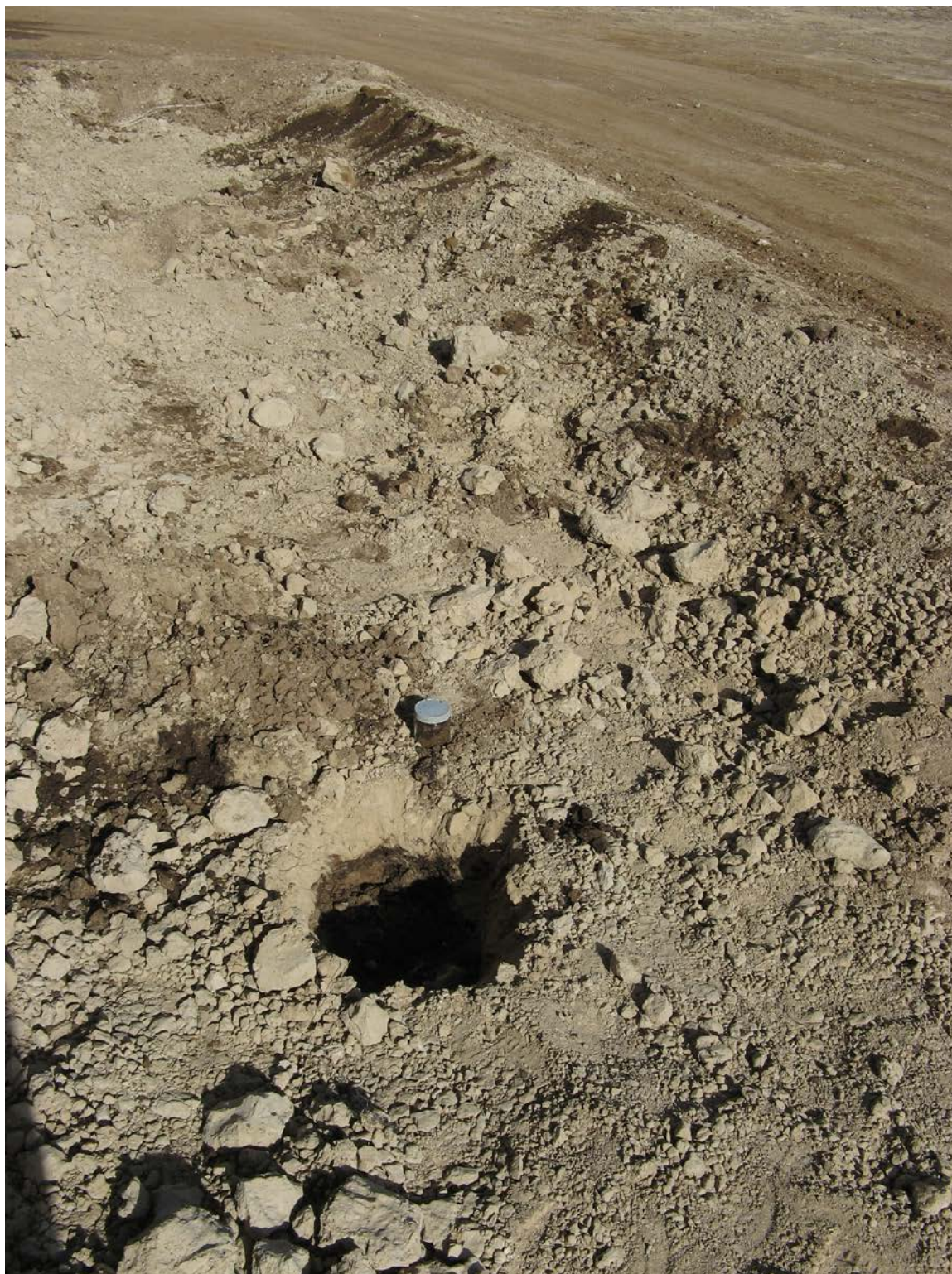
SS-2 Location center east side of battery - approximately 4" clean material. Sample collected from 4" to 10" bgs.