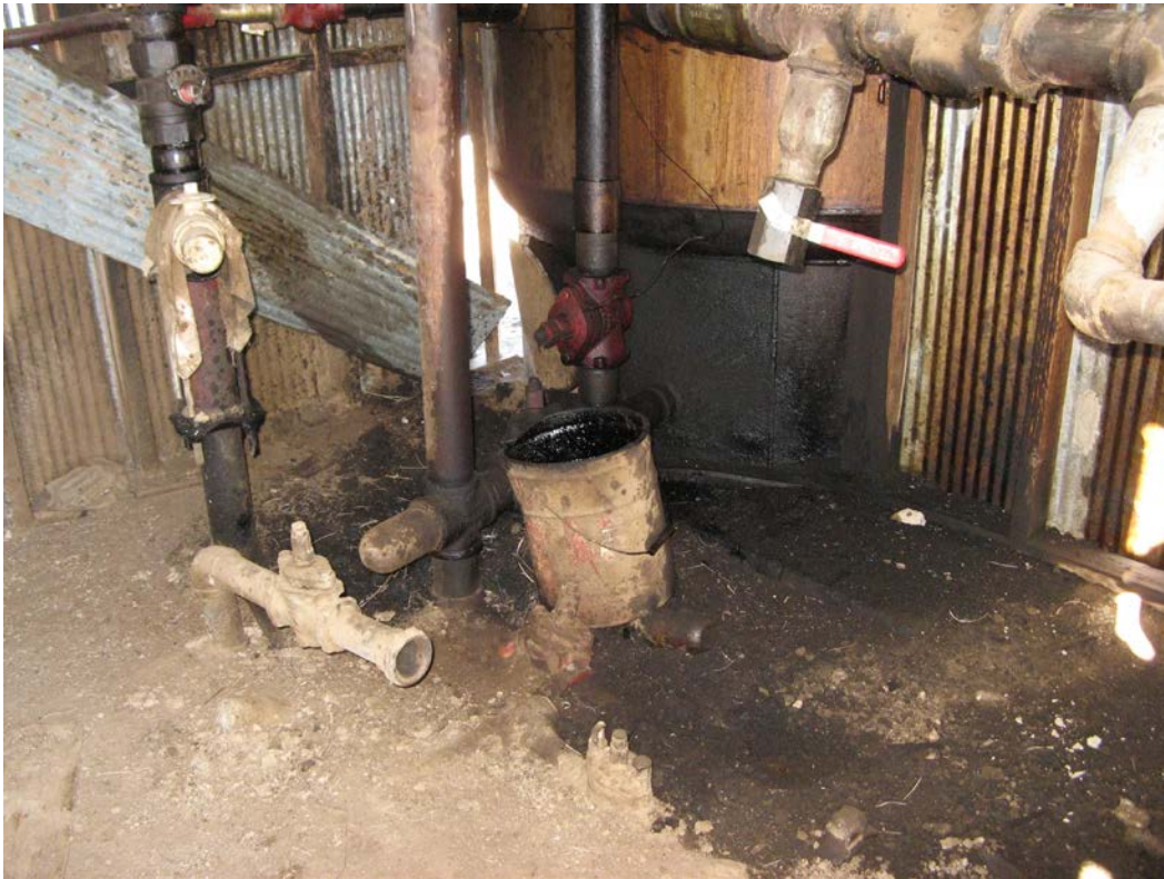
Inside treater shed.