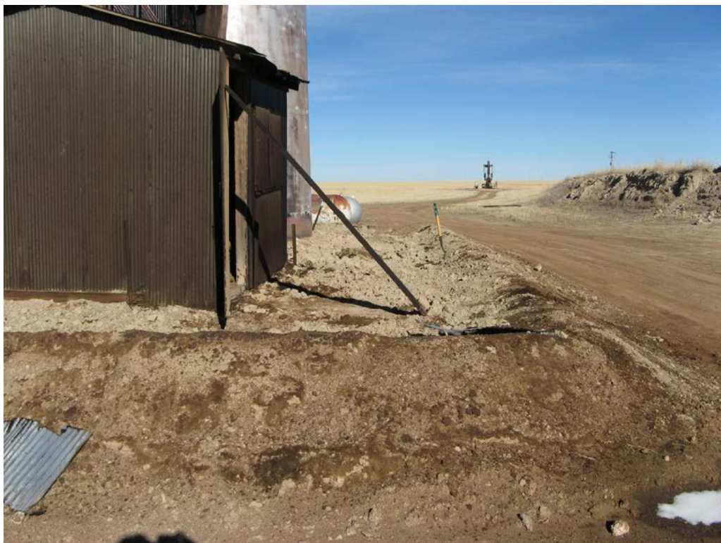
Looking North – east side of treater shed/battery.