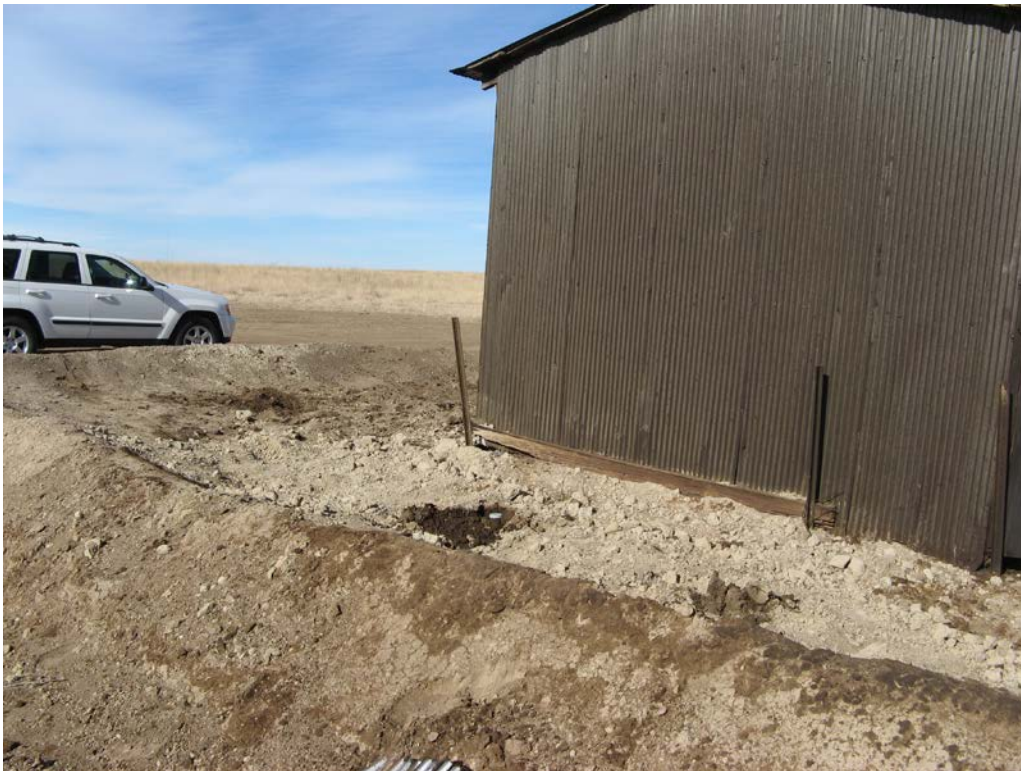
SS-1 Location south end of battery adjacent to treater shed from 1" to 6" bgs.