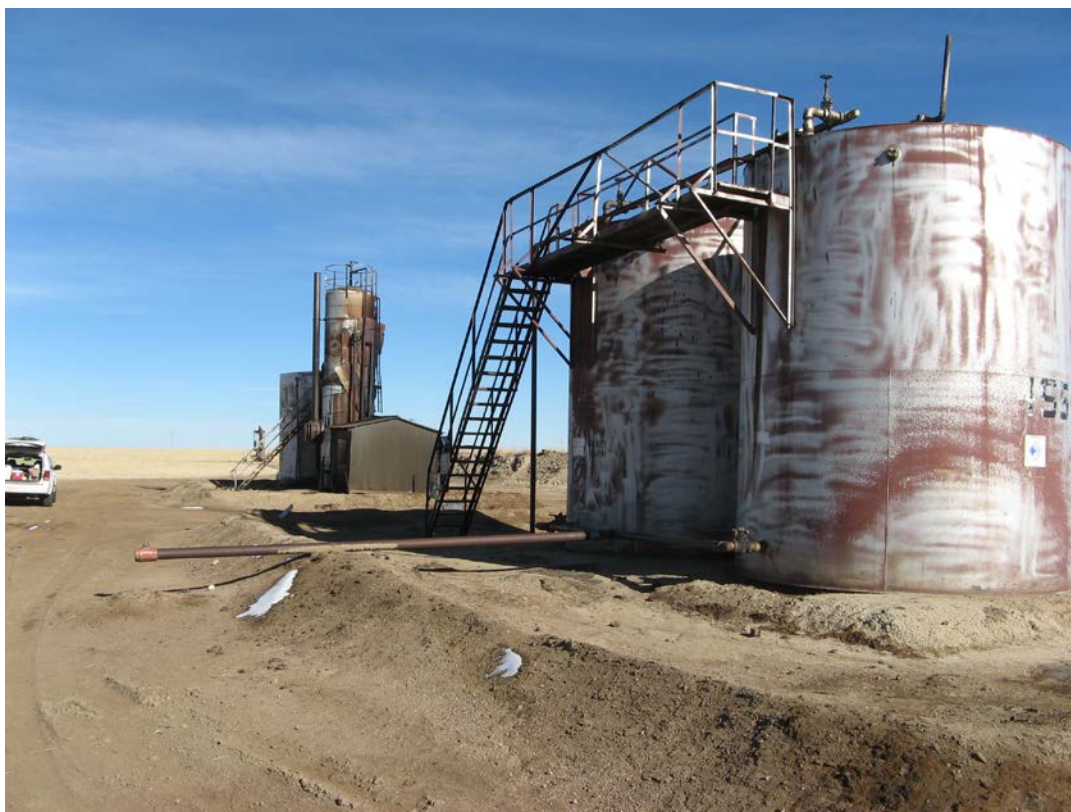
Oil stained dirt at production tank battery. Signs & labels inadequate.