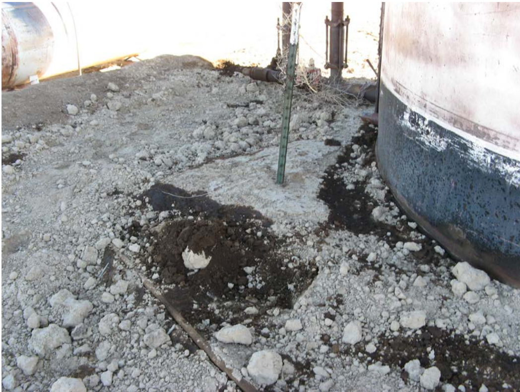
Fresh dirt covering oil saturated material NW corner tank battery.