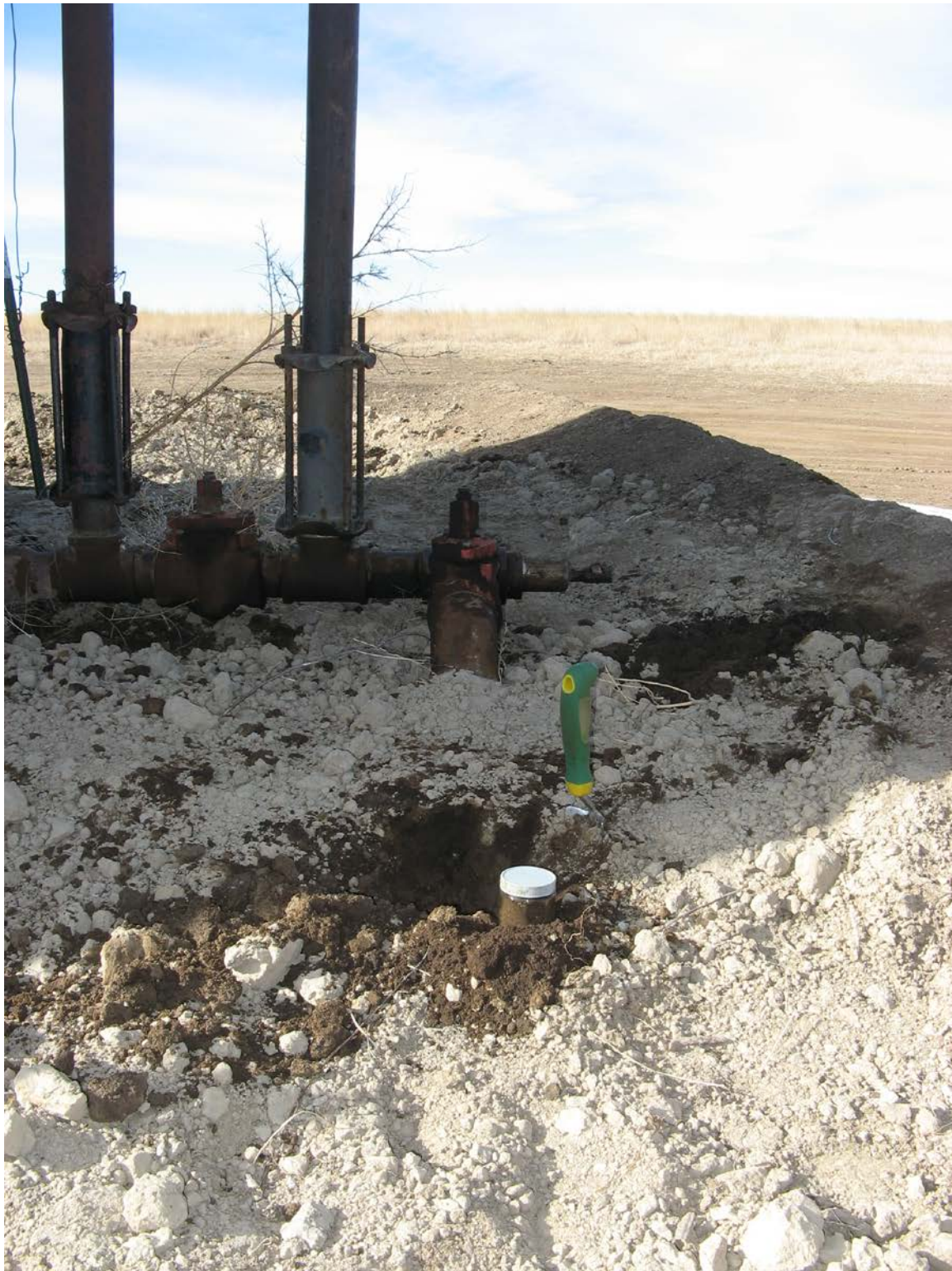
SS-3 Location north end of battery – sample collected from 0” to 6” bgs.