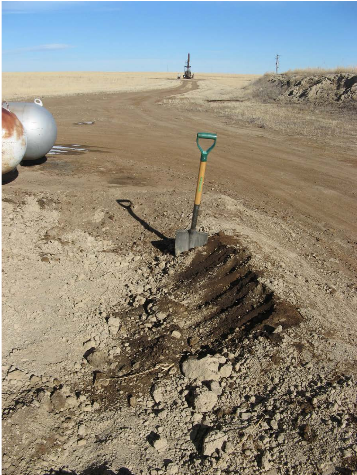
Fresh dirt removed from berm underlain by oil saturated material NE corner battery.