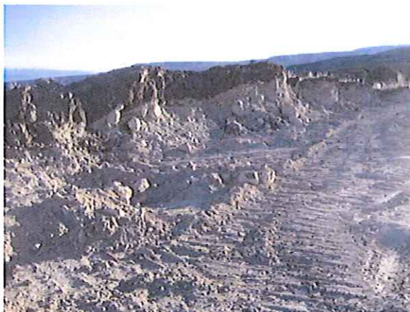
PAD LOCATION LOOKING EAST