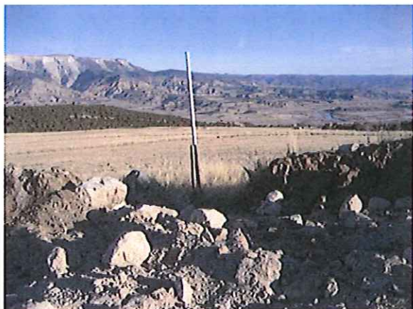
PAD LOCATION LOOKING NORTH