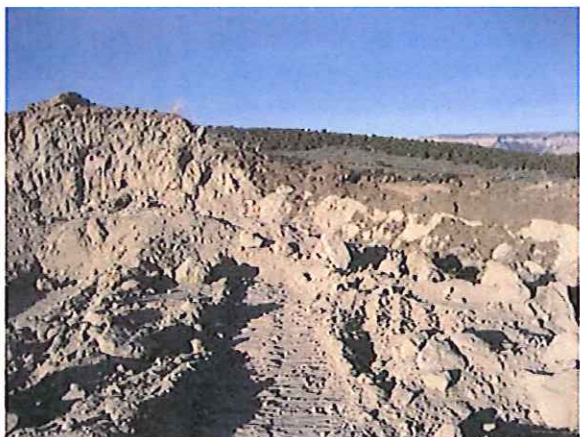
PAD LOCATION LOOKING WEST