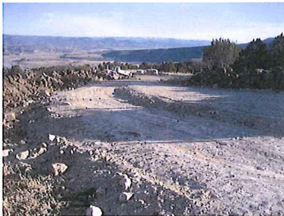
PAD ACCESS LOOKING NORTHEASTERLY

136 East Third Street Rifle, Colorado 81650 Ph. (970) 625-2720 Fax (970) 625-2773