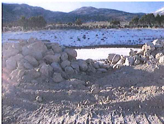
PAD LOCATION LOOKING SOUTH