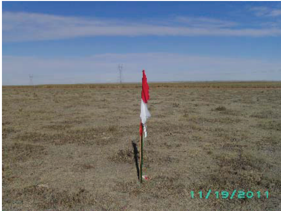
WELL LOCATION LOOKING NORTH