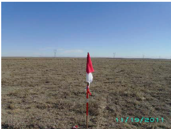
WELL LOCATION LOOKING EAST