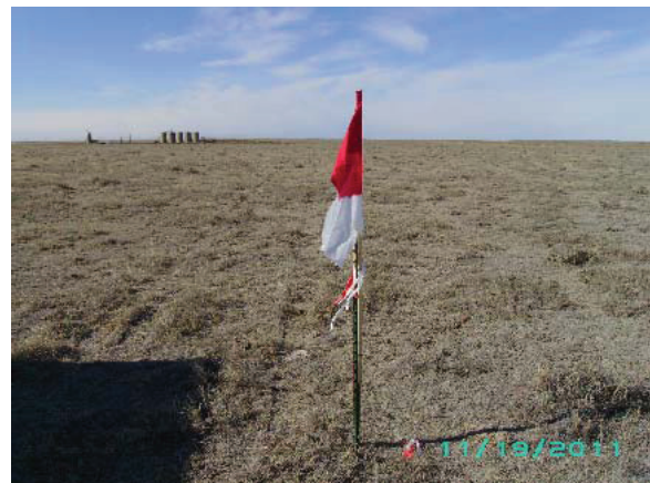
WELL LOCATION LOOKING WEST