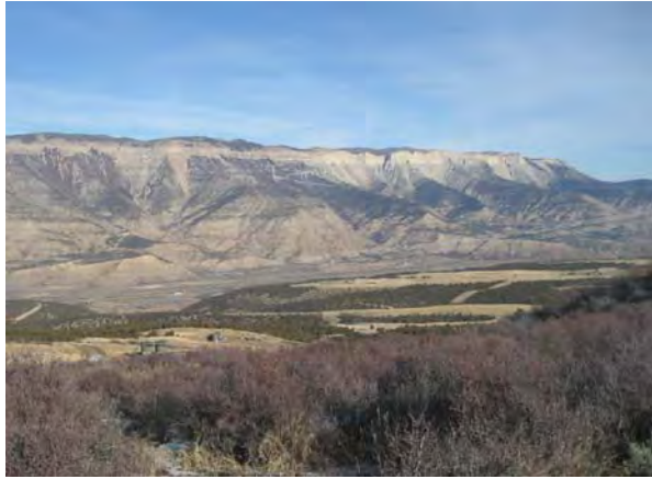
PAD LOCATION LOOKING NORTH