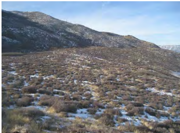
PAD LOCATION LOOKING WEST