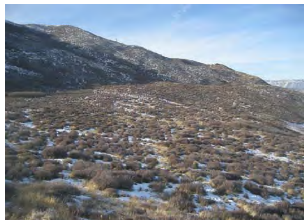
PAD OVERALL LOOKING WESTERLY