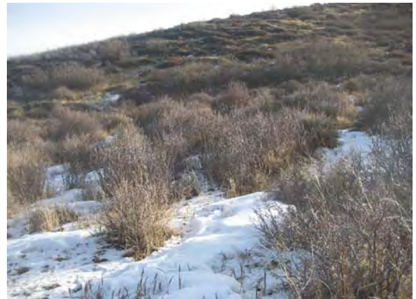
PAD LOCATION LOOKING EAST