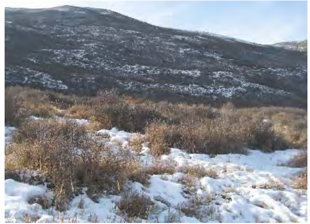
PAD LOCATION LOOKING SOUTH