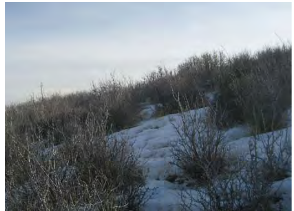
REFERENCE AREA LOOKING EAST