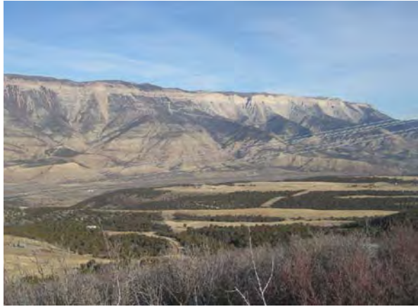
REFERENCE AREA LOOKING NORTH