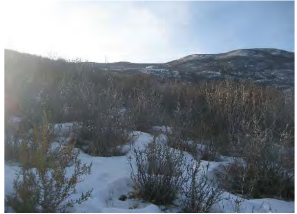
REFERENCE AREA LOOKING SOUTH