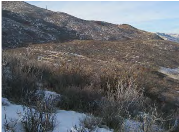
REFERENCE AREA LOOKING WEST