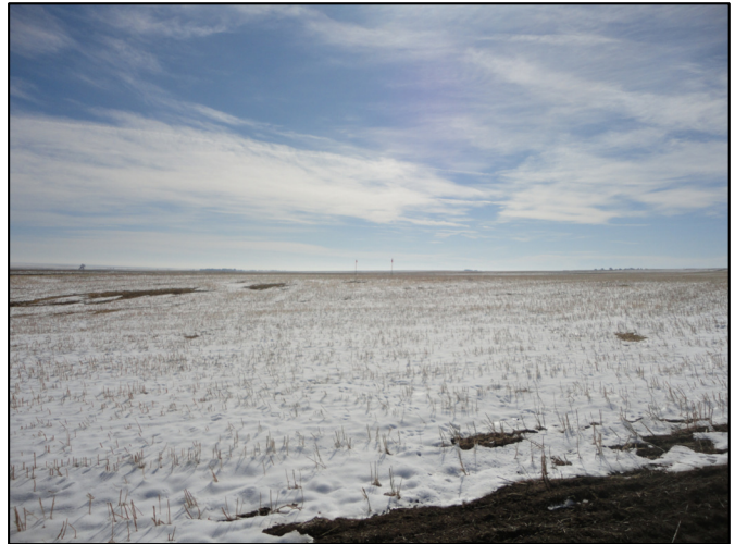
CROW VALLEY 7-62-35-2H South.jpg