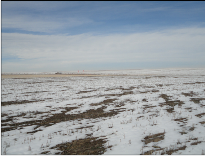
CROW VALLEY 7-62-35-2H North.jpg