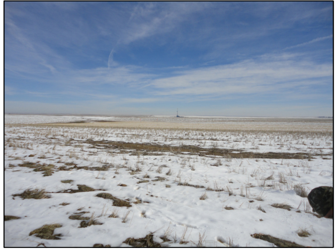
CROW VALLEY 7-62-35-2H East.jpg