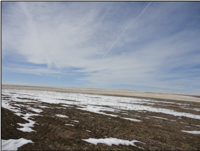
CROW VALLEY 7-62-35-2H West.jpg