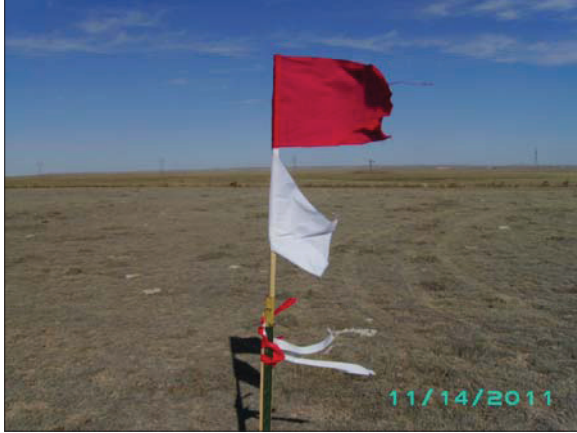
WELL LOCATION LOOKING NORTH