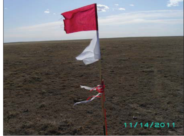
WELL LOCATION LOOKING SOUTH