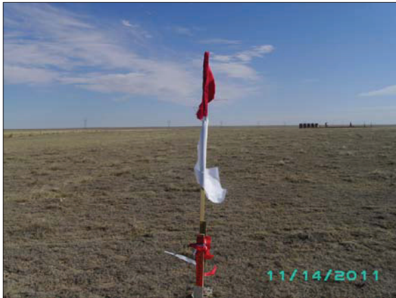
WELL LOCATION LOOKING EAST