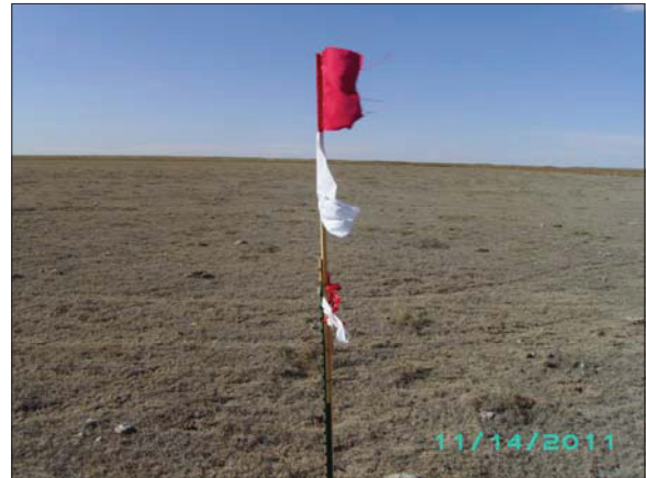
WELL LOCATION LOOKING WEST