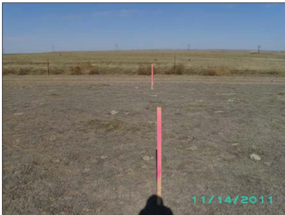
PROPOSED ACCESS AT PAD LOOKING NORTH