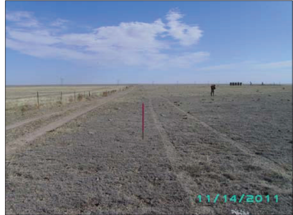
PROPOSED ACCESS AT TAKE-OFF LOOKING EAST