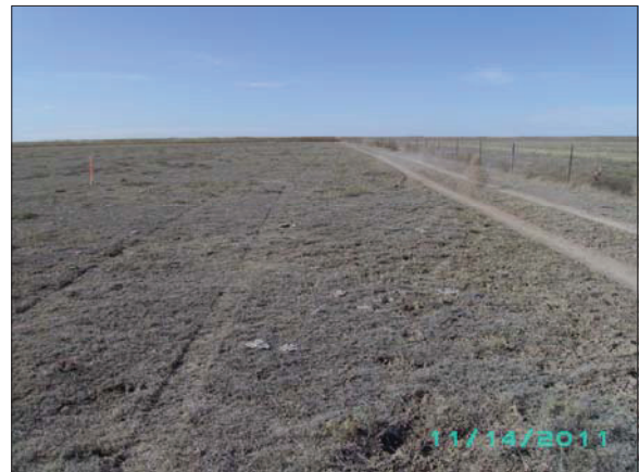
PROPOSED ACCESS AT TAKE-OFF LOOKING WEST