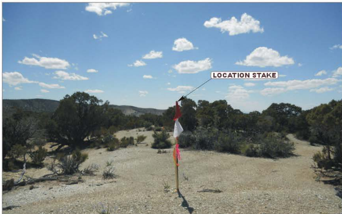
PHOTO: VIEW OF LOCATION STAKE