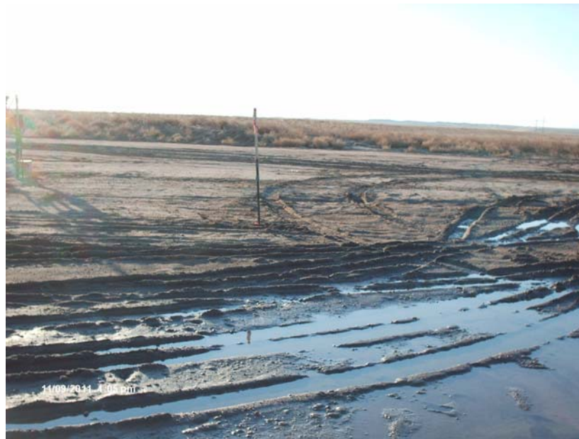
ANTELOPE H-17 NE 1/4 NW 1/4 SEC. 17 T5N R62W LOOKING WEST NOVEMBER 9, 2011