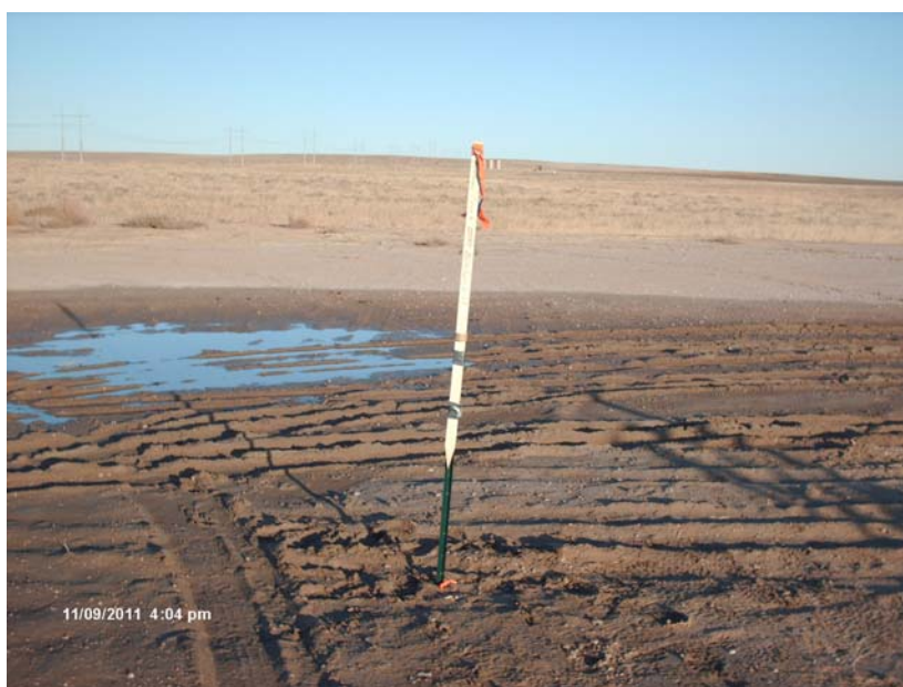
ANTELOPE H-17 NE 1/4 NW 1/4 SEC. 17 T5N R62W LOOKING EAST NOVEMBER 9, 2011