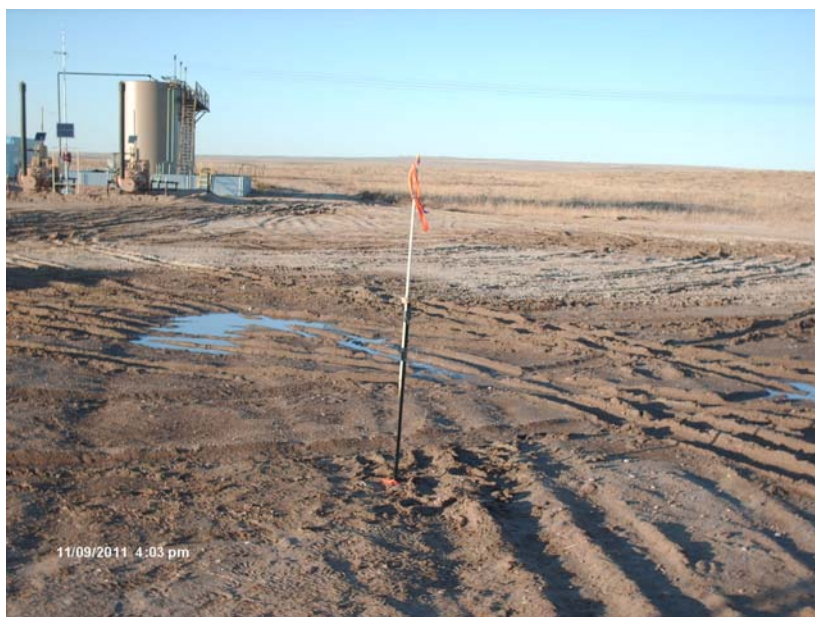
ANTELOPE L-17 NE 1/4 NW 1/4 SEC. 17 T5N R62W LOOKING NORTH NOVEMBER 9, 2011