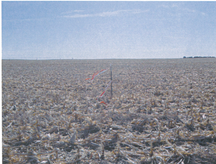
State 844-36-12 SW ¼ NW ¼ SEC. 36, T8N, R44W Looking South 17 November, 2011