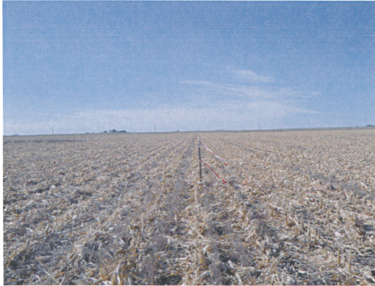
State 844-36-12 SW ¼ NW ¼ SEC. 36, T8N, R44W Looking West 17 November, 2011