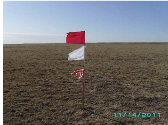
WELL LOCATION LOOKING SOUTH