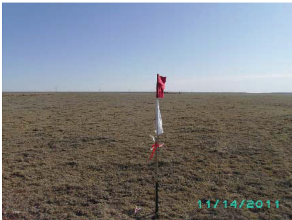
WELL LOCATION LOOKING EAST