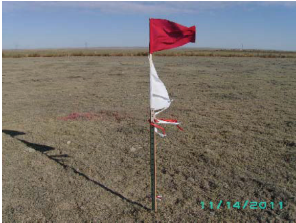
WELL LOCATION LOOKING NORTH