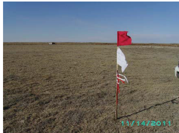
WELL LOCATION LOOKING WEST