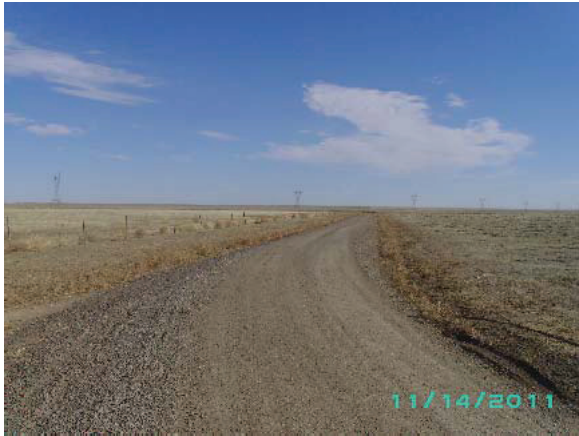
PROPOSED ACCESS AT TAKE-OFF LOOKING EAST