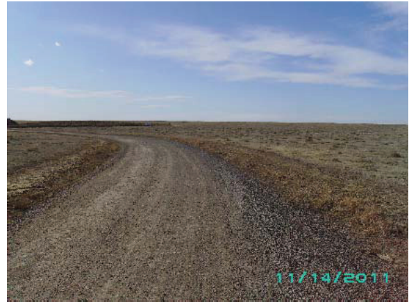
PROPOSED ACCESS AT TAKE-OFF LOOKING WEST