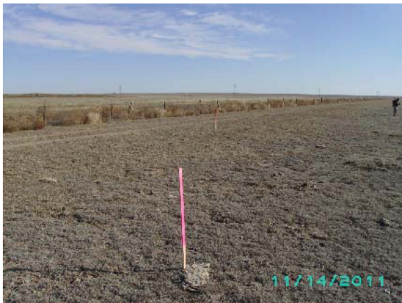
PROPOSED ACCESS AT PAD LOOKING NORTHEAST