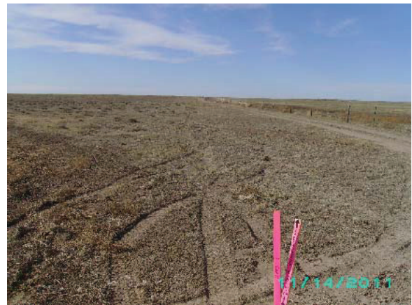
PROPOSED ACCESS AT PAD LOOKING WEST