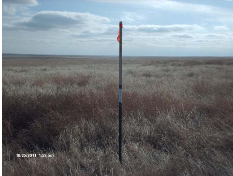
PRONGHORN 31-44-06 HZ NW 1/4 NE 1/4 SEC. 6 T5N R61W LOOKING SOUTH OCTOBER 25, 2011