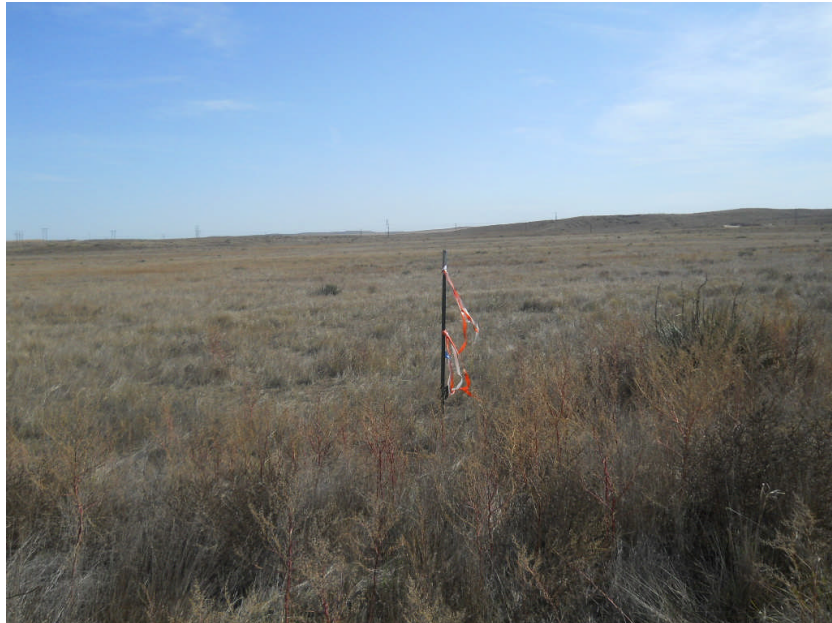
Five Rivers 32-19 2N46W SW ¼ NE ¼ SEC. 19, T2N, R46W Looking East 21 October, 2011