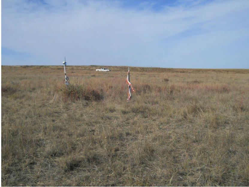
Five Rivers 32-19 2N46W SW ¼ NE ¼ SEC. 19, T2N, R46W Looking West 21 October, 2011