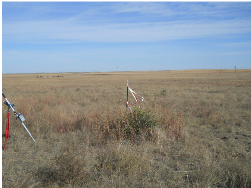
Five Rivers 32-19 2N46W SW ¼ NE ¼ SEC. 19, T2N, R46W Looking North 21 October, 2011