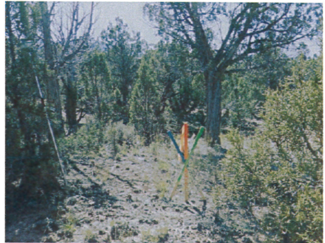
REFERENCE AREA LOOKING SOUTH OCTOBER 4, 2011