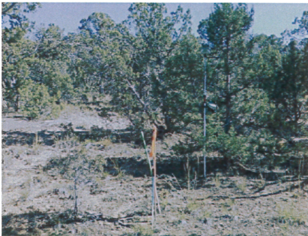
REFERENCE AREA LOOKING EAST OCTOBER 4, 2011