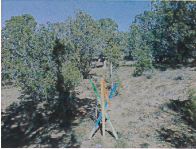
REFERENCE ARE3A LOOKING NORTH OCTOBER 4, 2011