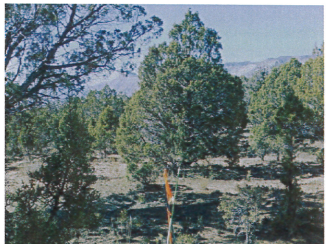
REFERENCE AREA LOOKING WEST OCTOBER 4, 2011

LATITUDE (NAD83) NORTH 39.378535 DEG. LONGITUDE (NAD83) WEST 108.054521 DEG.