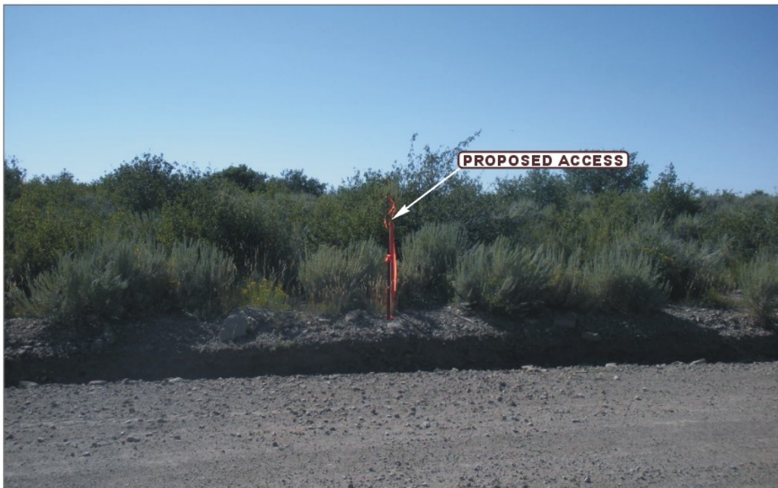
PHOTO: VIEW FROM BEGINNING OF PROPOSED ACCESS